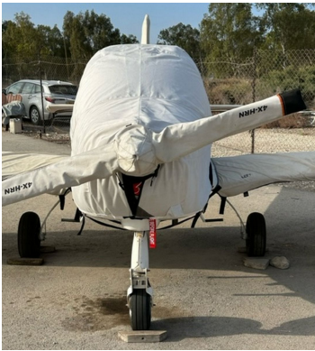
Tecnam Sierra Complete Cover Set

WINTER USE MATERIAL - Made with Solution-Dyed Polyester fabric, this option is intended for seasonal use to aid in deicing, rain mitigation, or for occasional travel. The material is lighter and more compact, but more susceptible to UV damage and may have a shorter useful life if used continuously outside than the all-year use material.