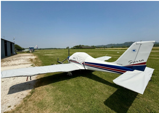
Tecnam P2002 Sierra Canopy, Wing & Horizontal Stabilizer Covers