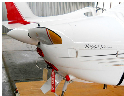
Tecnam Sierra Engine Inlet Plugs set