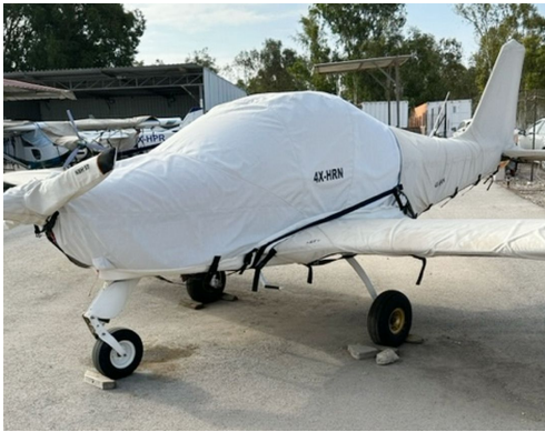
Tecnam Sierra Complete Cover Set