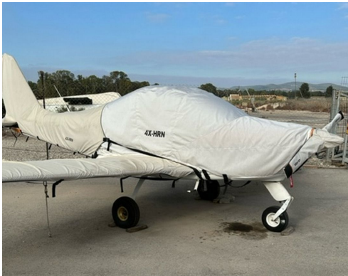
Tecnam Sierra Complete Cover Set

This cover type is made from Silver Acrylic Sunbrella canvas and is 100% lined with a soft and smooth microfiber. Bruce's Custom Covers developed this material combination especially for aircraft protection. The outer material is medium weight and treated for water resistance, UV resistance and anti-static buildup. The inner lining is a very soft and smooth microfiber to prevent scratching. The material is very reflective, and tests show that the cabin interior temperature can be reduced to near-ambient temperature on the hottest of days. It is water, ice and snow repellent, yet breathable to allow moisture to escape from between the cover and the aircraft surface.