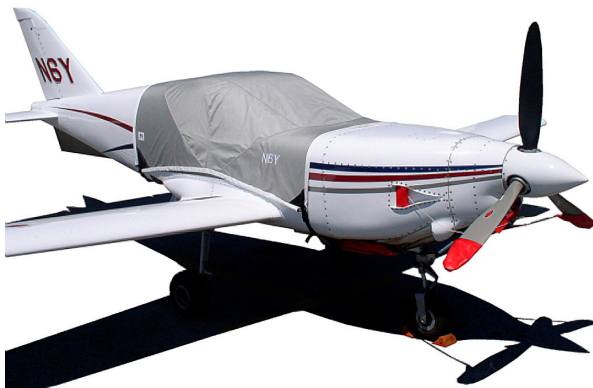
The Swearingen SX300 Canopy Cover, Engine Plugs & Prop Ties