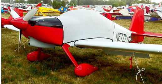
Light Weight Fitted Hangar Dust Cover

occasional use outside. We also have an ultra lightweight material available for fitted hangar dust covers. For daily outdoor use, the non-travel Sunbrella Cover is the best choice.