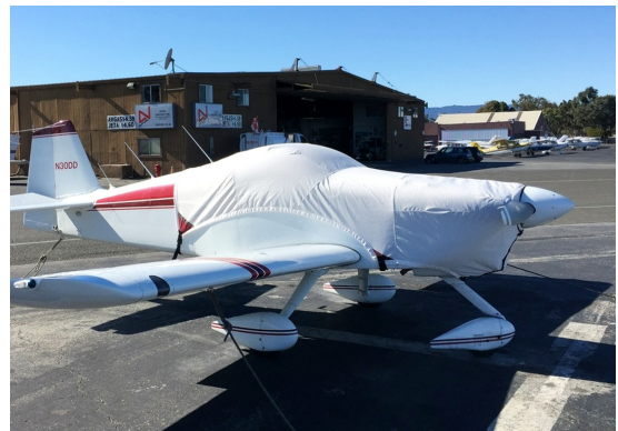
Van's RV-6A Canopy/Engine Cover