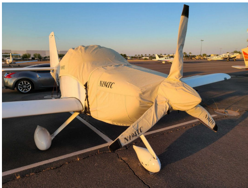
Van's RV-9 Canopy, Engine & Prop Covers

This cover type is made from Silver Acrylic Sunbrella canvas and is 100% lined with a soft and smooth microfiber. Bruce's Custom Covers developed this material combination especially for aircraft protection. The outer material is medium weight and treated for water resistance, UV resistance and anti-static buildup. The inner lining is a very soft and smooth microfiber to prevent scratching. The material is very reflective, and tests show that the cabin interior temperature can be reduced to near-ambient temperature on the hottest of days. It is water, ice and snow repellent, yet breathable to allow moisture to escape from between the cover and the aircraft surface.