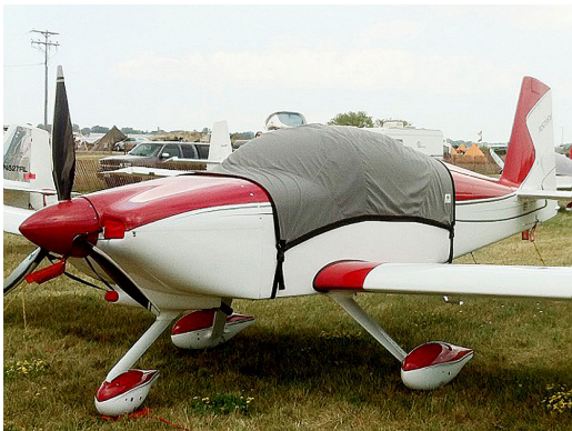
Van's RV-9 Travel Canopy Cover