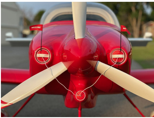
Van's RV-9 Engine Plugs Set, Sam James Cowling