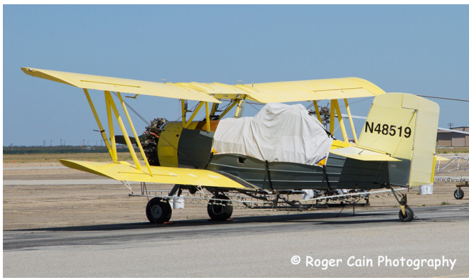
Grumman AG Cat Canopy Cover