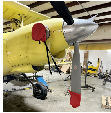
Schweizer Ag-Cat Prop Tie/Exhaust Cover Set