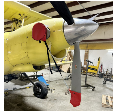
Schweizer Ag-Cat Prop Tie/Exhaust Cover Set