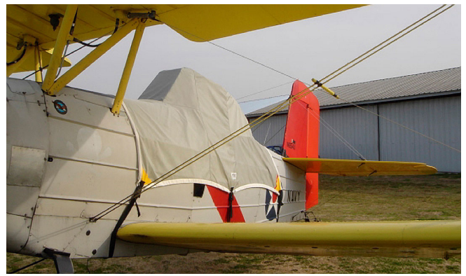
Ag-Cat Canopy Cover