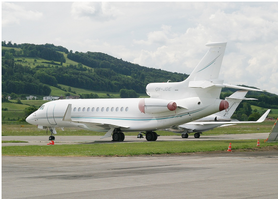
Falcon 7X Engine Cover Set

The Falcon Jet 7X Intake Covers are designed to install easily yet be completely storable. A spring steel hoop is sewn into the hem of each cover, allowing them to be installed without climbing onto the wing or using a stepladder. To store the covers the spring steel hoop folds like a band-saw blade into three nesting rings. Each cover folds into a compact circular bundle which is stored in the included duffle bag, yet they unfold quickly for use. The Tri-Fold Ring cover is made of medium weight nylon which is available in a variety of colors to match the paint trim. Each cover set comes complete with installation and folding instructions. The aircraft's registration number can be silkscreened onto the cover for an extra charge.