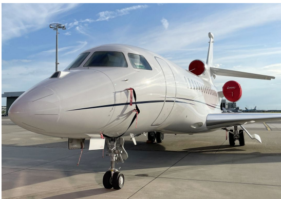
Falcon 7X Engine Cover Set, Pitot Covers

The Engine Inlet Plugs are custom fit for your Falcon Jet 7X intakes, made with heavy-duty vinyl material, and stuffed with a single block of sculpted urethane foam. Each plug has a zipper that allows the foam to be removed and dried if necessary. Engine plugs have 'remove before flight' streamers sewn onto the face of the plugs. Most plugs are imprinted with the aircraft registration number in black for an extra charge. Storage bag NOT included. Engine plugs may be inserted after flight when the engine is still warm. Engine Inlet Plugs are commonly referred to as Cowl Plugs, Intake Plugs, Cowl Blocks, Engine Blocks, and Engine Bungs.