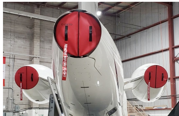
Falcon F7X Exhaust Plugs