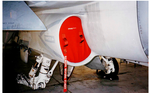
Engine Inlet Plug