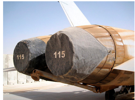
F-18 Exhaust Covers