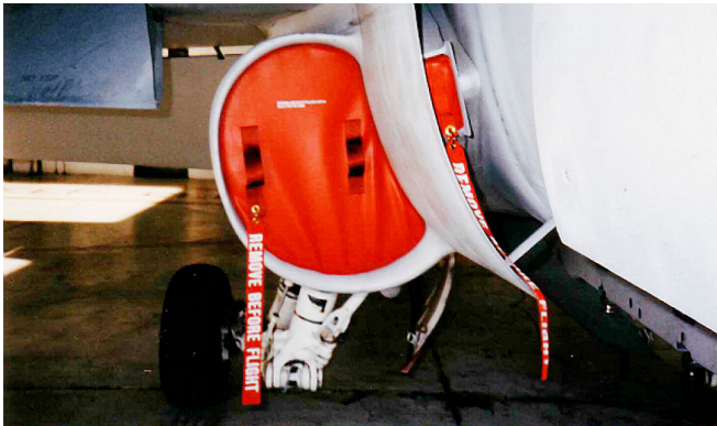
Engine & ECS Inlet Plugs

The Engine Inlet Plugs are custom fit for your McDonnell Douglas F-18 Hornet, Super Hornet intakes, made with heavy-duty vinyl material, and stuffed with a single block of sculpted urethane foam. Each plug has a zipper that allows the foam to be removed and dried if necessary. Engine plugs have 'remove before flight' streamers sewn onto the face of the plugs. Most plugs are imprinted with the aircraft registration number in black for an extra charge. Storage bag NOT included. Engine plugs may be inserted after flight when the engine is still warm. Engine Inlet Plugs are commonly referred to as Cowl Plugs, Intake Plugs, Cowl Blocks, Engine Blocks, and Engine Bungs.