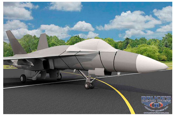
F-18 Canopy Cover, illustration