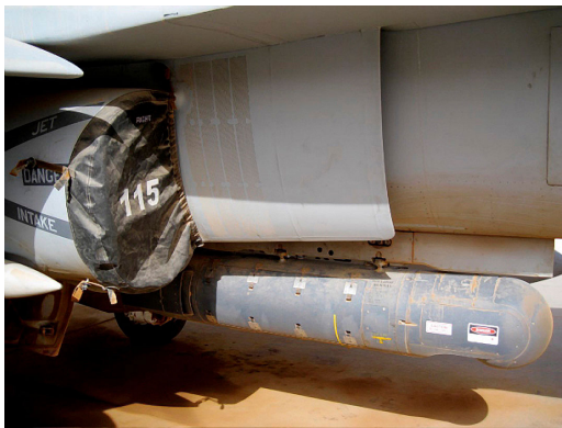
F-18 Intake Covers

The McDonnell Douglas F-18 Hornet, Super Hornet Intake Covers are designed to install easily yet be completely storable. A spring steel hoop is sewn into the hem of each cover, allowing them to be installed without climbing onto the wing or using a stepladder. To store the covers the spring steel hoop folds like a band-saw blade into three nesting rings. Each cover folds into a compact circular bundle which is stored in the included duffle bag, yet they unfold quickly for use. The Tri-Fold Ring cover is made of medium weight nylon which is available in a variety of colors to match the paint trim. Each cover set comes complete with installation and folding instructions. The aircraft's registration number can be silkscreened onto the cover for an extra charge.