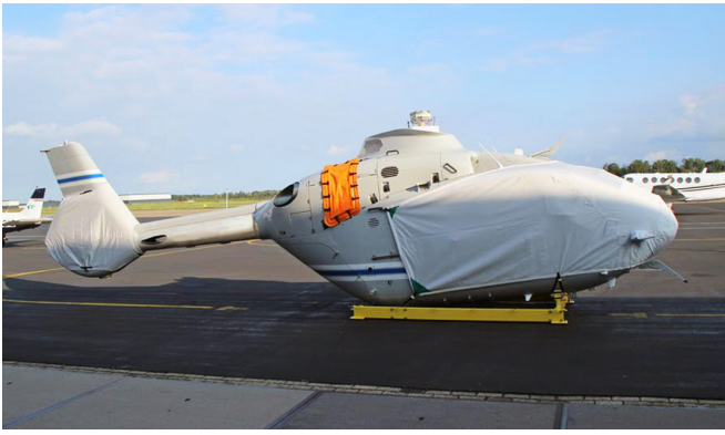
Bubble Cover and Tailfan Cover