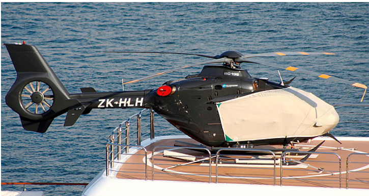
EC-135 Bubble Cover & Exhaust Plugs

This cover type is made from Silver Acrylic Sunbrella canvas and is 100% lined with a soft and smooth microfiber. Bruce's Custom Covers developed this material combination especially for aircraft protection. The outer material is medium weight and treated for water resistance, UV resistance and anti-static buildup. The inner lining is a very soft and smooth microfiber to prevent scratching. The material is very reflective, and tests show that the cabin interior temperature can be reduced to near-ambient temperature on the hottest of days. It is water, ice and snow repellent, yet breathable to allow moisture to escape from between the cover and the aircraft surface.