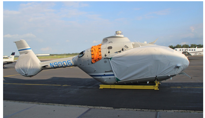
Eurocopter EC-135 Bubble & Tailfan Covers