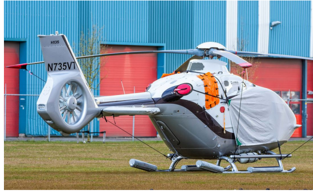
Airbus EC135T3 Blade Tie-Downs