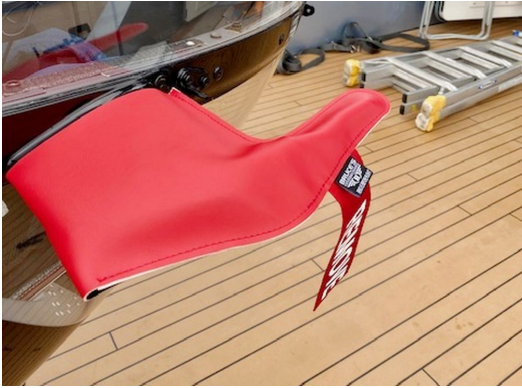
Airbus Helicopter H145 Pitot Tube Cover

The Engine Inlet Plugs are custom fit for your Eurocopter EC-135 intakes, made with heavy-duty vinyl material, and stuffed with a single block of sculpted urethane foam. Each plug has a zipper that allows the foam to be removed and dried if necessary. Engine plugs have 'Remove Before Flight' streamers sewn onto the face of the plugs. Most plugs are imprinted with the aircraft registration number in black for an extra charge. Storage bag NOT included. Engine plugs may be inserted after flight when the engine is still warm. Engine Inlet Plugs are commonly referred to as Cowl Plugs, Intake Plugs, Cowl Blocks, Engine Blocks, and Engine Bungs.