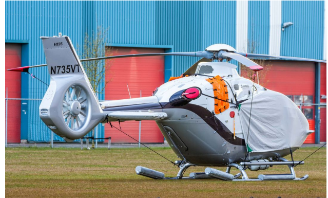
Airbus EC135T3 Blade Tie-Downs