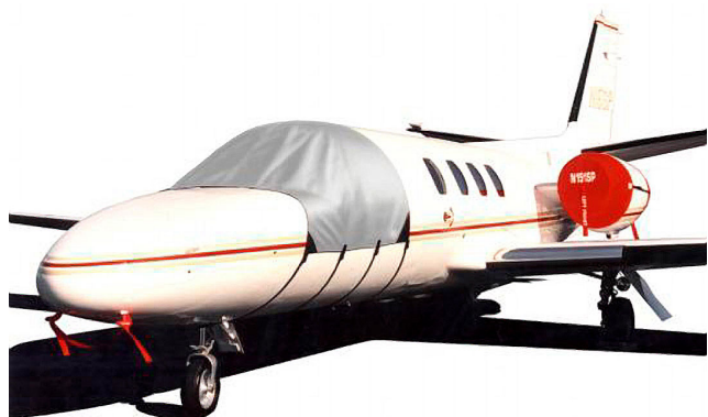
Citation Windshield Cover, Engine Cover set and Pitot Covers

The Cessna Citation II (550, 551, UC-35A, with JT15D) Intake Covers are designed to install easily yet be completely storable. A spring steel hoop is sewn into the hem of each cover, allowing them to be installed without climbing onto the wing or using a stepladder. To store the covers the spring steel hoop folds like a band-saw blade into three nesting rings. Each cover folds into a compact circular bundle which is stored in the included duffle bag, yet they unfold quickly for use. The Tri-Fold Ring cover is made of medium weight nylon which is available in a variety of colors to match the paint trim. Each cover set comes complete with installation and folding instructions. The aircraft's registration number can be silkscreened onto the cover for an extra charge.