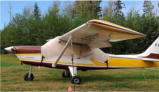
Lark Canopy Cover

The material is very reflective, and tests show that the cabin interior temperature can be reduced to near-ambient temperature on the hottest of days. It is water, ice and snow repellent, yet breathable to allow moisture to escape from between the cover and the aircraft surface.