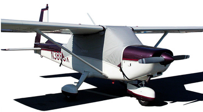
Lark Canopy Cover