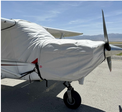
Aero Commander Lark Engine Cover

water resistance, UV resistance and anti-static buildup. The inner lining is a very soft and smooth microfiber to prevent scratching. The material is very reflective, and tests show that the cabin interior temperature can be reduced to near-ambient temperature on the hottest of days. It is water, ice and snow repellent, yet breathable to allow moisture to escape from between the cover and the aircraft surface.