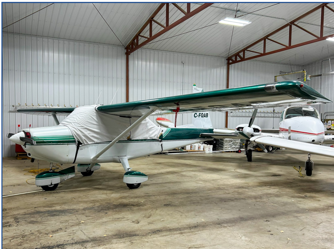
Rockwell Aero Commander Lark Canopy Cover, Engine Plugs