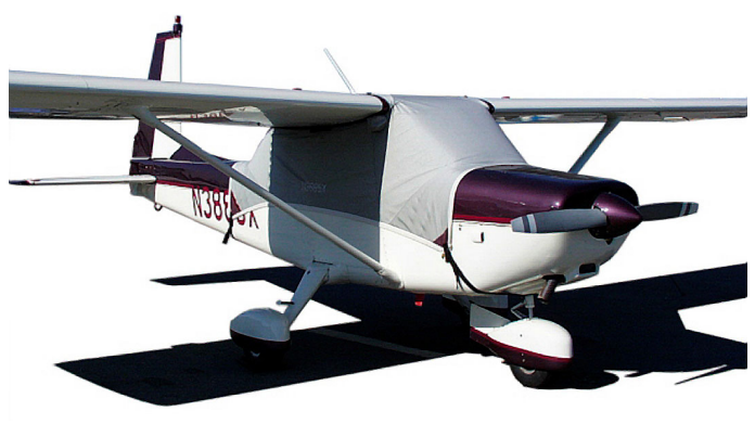
Lark Canopy Cover