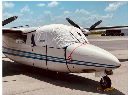
Aero Commander 690C Cockpit Cover