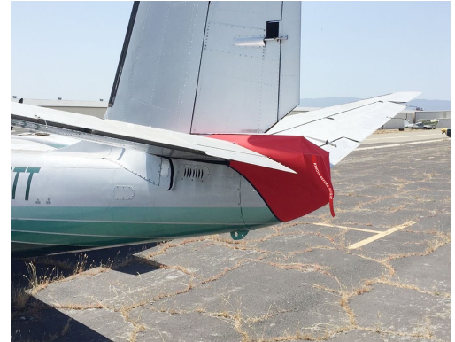
Rockwell Aero Commander Tailcone Cover