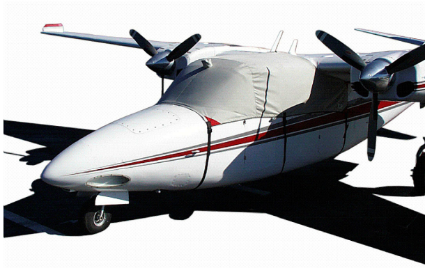
Aero Commander 680 Canopy Cover