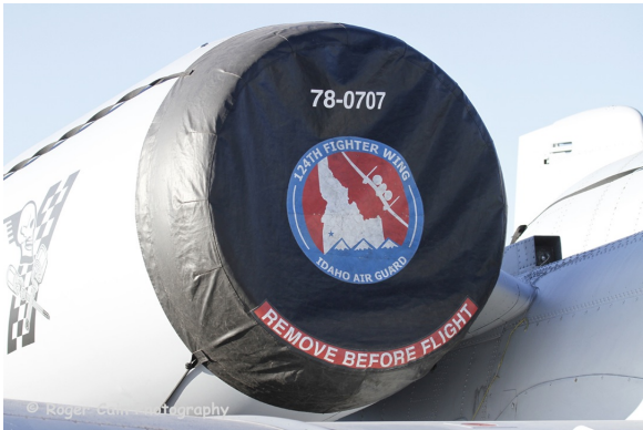
Fairchild A-10 Engine Covers

ALL-YEAR USE MATERIAL - Made with Solution dyed Polyester fabric, the all-year use material is the best option for sun protection and cover longevity. This heavier more durable material is intended for all weather conditions, such as rain and snow or lots of sun.