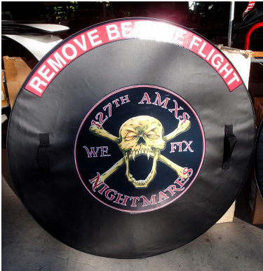
A-10 Engine Intake Plug

The Engine Inlet Plugs are custom fit for your Fairchild A10 Thunderbolt intakes, made with heavy-duty vinyl material, and stuffed with a single block of sculpted urethane foam. Each plug has a zipper that allows the foam to be removed and dried if necessary. Engine plugs have 'remove before flight' streamers sewn onto the face of the plugs. Most plugs are imprinted with the aircraft registration number in black for an extra charge. Storage bag NOT included. Engine plugs may be inserted after flight when the engine is still warm. Engine Inlet Plugs are commonly referred to as Cowl Plugs, Intake Plugs, Cowl Blocks, Engine Blocks, and Engine Bungs.