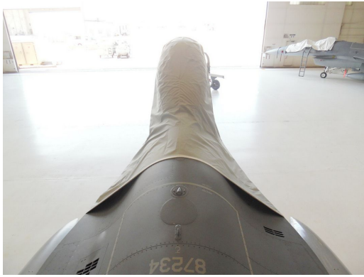
F-16 CANOPY COVER, OPEN POSITION (C-Model, single seat models)

Canopy Covers are commonly referred to as Cabin Covers, Fuselage Covers, Canvas Covers, Canopy Caps, etc.