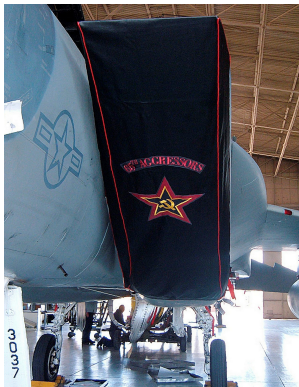
F15 Intake Cover

The McDonnell Douglas F-15 Eagle Intake Covers are designed to install easily yet be completely storable. A spring steel hoop is sewn into the hem of each cover, allowing them to be installed without climbing onto the wing or using a stepladder. To store the covers the spring steel hoop folds like a band-saw blade into three nesting rings. Each cover folds into a compact circular bundle which is stored in the included duffle bag, yet they unfold quickly for use. The Tri-Fold Ring cover is made of medium weight nylon which is available in a variety of colors to match the paint trim. Each cover set comes complete with installation and folding instructions. The aircraft's registration number can be silkscreened onto the cover for an extra charge.