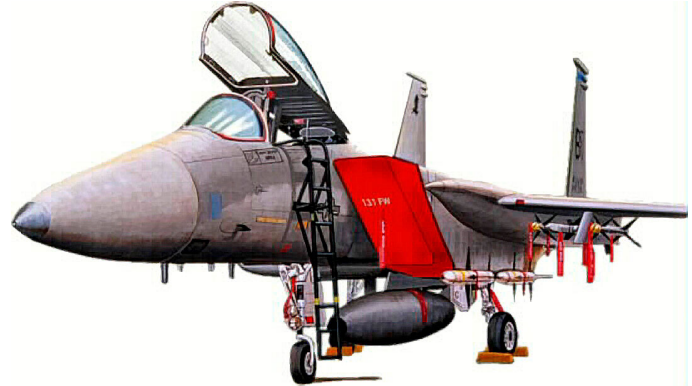
F15 Cockpit HeatShields & Inlet Cover