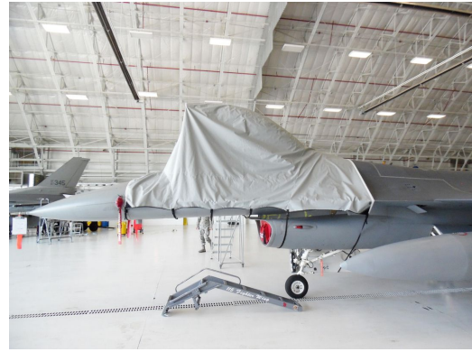
F-16 CANOPY COVER, OPEN POSITION (C-Model, single seat models)