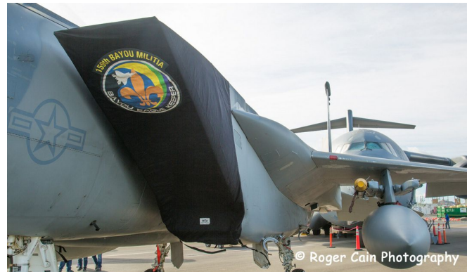
McDonnell-Douglas F-15 Intake Covers