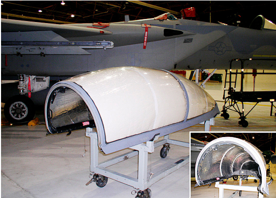
F-15 Cockpit HeatShield

Heatshields are interior sunshades for an aircraft's windows or canopy glass. The product is a unique composite of closed-cell foam with a silver mylar finish. The semi-rigid design is stiff enough to stand along the inside of the windshield using sun visors or window framing. It folds up flat and easily stores in the included storage sleeve. Some designs may require velcro and suction cups. A Heatshield is an excellent short-term remedy for cockpit overheating.