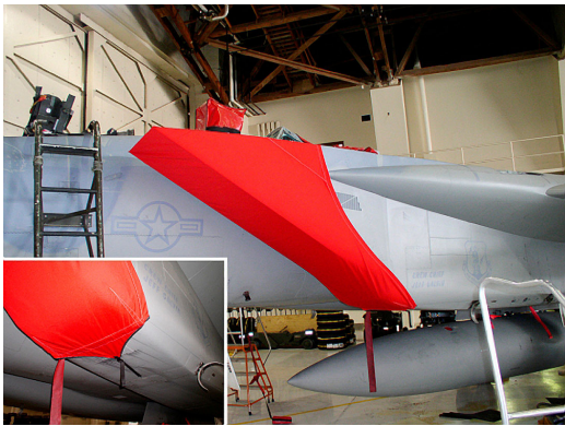
Intake Cover, Attachment Detail (inset)