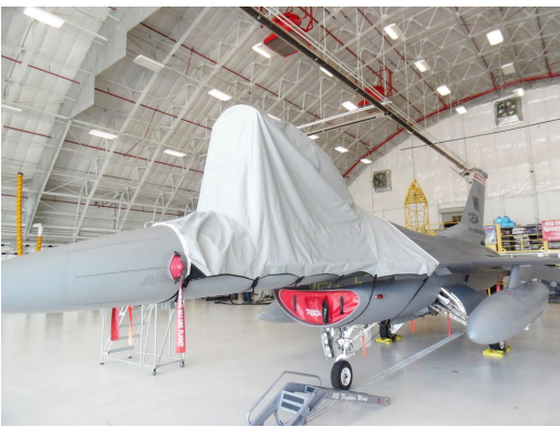
F-16 CANOPY COVER, OPEN POSITION (C-Model, single seat models)