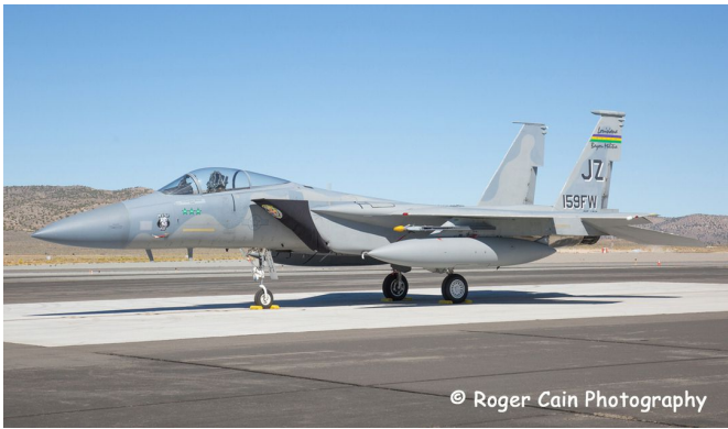
McDonnell-Douglas F-15 Intake Covers

The McDonnell Douglas F-15 Eagle Intake Covers are designed to install easily yet be completely storable. A spring steel hoop is sewn into the hem of each cover, allowing them to be installed without climbing onto the wing or using a stepladder. To store the covers the spring steel hoop folds like a band-saw blade into three nesting rings. Each cover folds into a compact circular bundle which is stored in the included duffle bag, yet they unfold quickly for use. The Tri-Fold Ring cover is made of medium weight nylon which is available in a variety of colors to match the paint trim. Each cover set comes complete with installation and folding instructions. The aircraft's registration number can be silkscreened onto the cover for an extra charge.