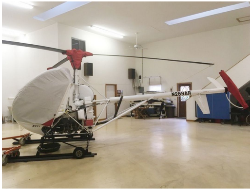
Schweizer 269C Rotor Hub cover