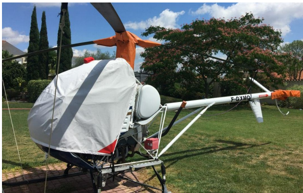
Hughes/Schweizer 300C Bubble Cover & Rotor Hub Cover

WINTER USE MATERIAL - Made with Solution-Dyed Polyester fabric, this option is intended for seasonal use to aid in deicing, rain mitigation, or for occasional travel. The material is lighter and more compact, but more susceptible to UV damage and may have a shorter useful life if used continuously outside than the all-year use material.