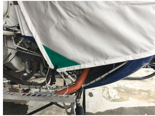
Hughes/Schweizer 300C Bubble Cover