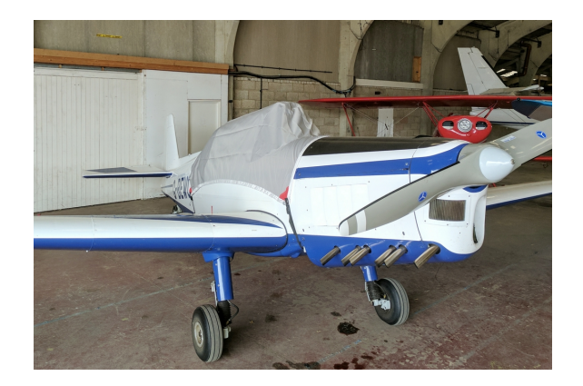
Zlin 326 Travel Cover