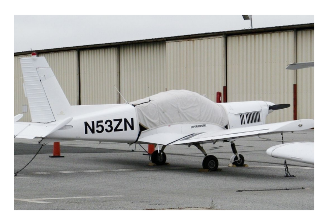
Zlin 142 Canopy Cover