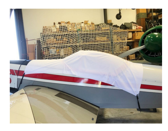
Zlin 526 Canopy Cover, test fit cover

Travel Covers are made with Silver Solution-Dyed Polyester fabric and only lined over the windshield to save weight. The material is lightweight and more compact for easy stowage in the aircraft. The polyester material is water resistant, but only intended for occasional use outside. We also have an ultra lightweight material available for fitted hangar dust covers. For daily outdoor use, the non-travel Sunbrella Cover is the best choice.