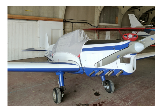
Zlin 326 Travel Cover

Travel Covers are made with Silver Solution-Dyed Polyester fabric and only lined over the windshield to save weight. The material is lightweight and more compact for easy stowage in the aircraft. The polyester material is water resistant, but only intended for occasional use outside. We also have an ultra lightweight material available for fitted hangar dust covers. For daily outdoor use, the non-travel Sunbrella Cover is the best choice.