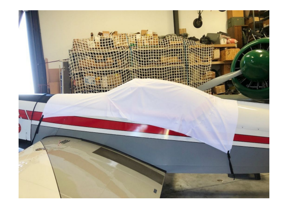
Zlin 526 Canopy Cover, test fit cover