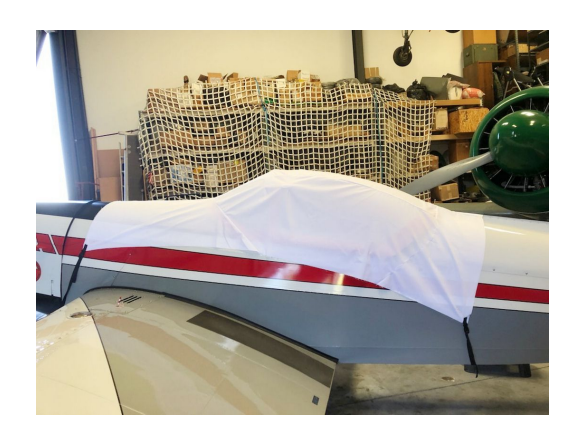
Zlin 526 Canopy Cover, test fit cover

the hottest of days. It is water, ice and snow repellent, yet breathable to allow moisture to escape from between the cover and the aircraft surface.