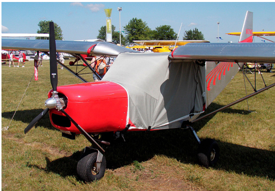
Zenith CH701 Standard Canopy Cover