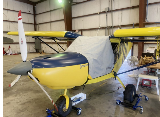
Zenith 750 Windshield/Skylight Cover