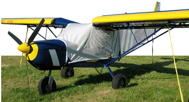
Zenith 701 Standard Canopy Cover

This cover type is made from Silver Acrylic Sunbrella canvas and is 100% lined with a soft and smooth microfiber. Bruce's Custom Covers developed this material combination especially for aircraft protection. The outer material is medium weight and treated for water resistance, UV resistance and anti-static buildup. The inner lining is a very soft and smooth microfiber to prevent scratching. The material is very reflective, and tests show that the cabin interior temperature can be reduced to near-ambient temperature on the hottest of days. It is water, ice and snow repellent, yet breathable to allow moisture to escape from between the cover and the aircraft surface.