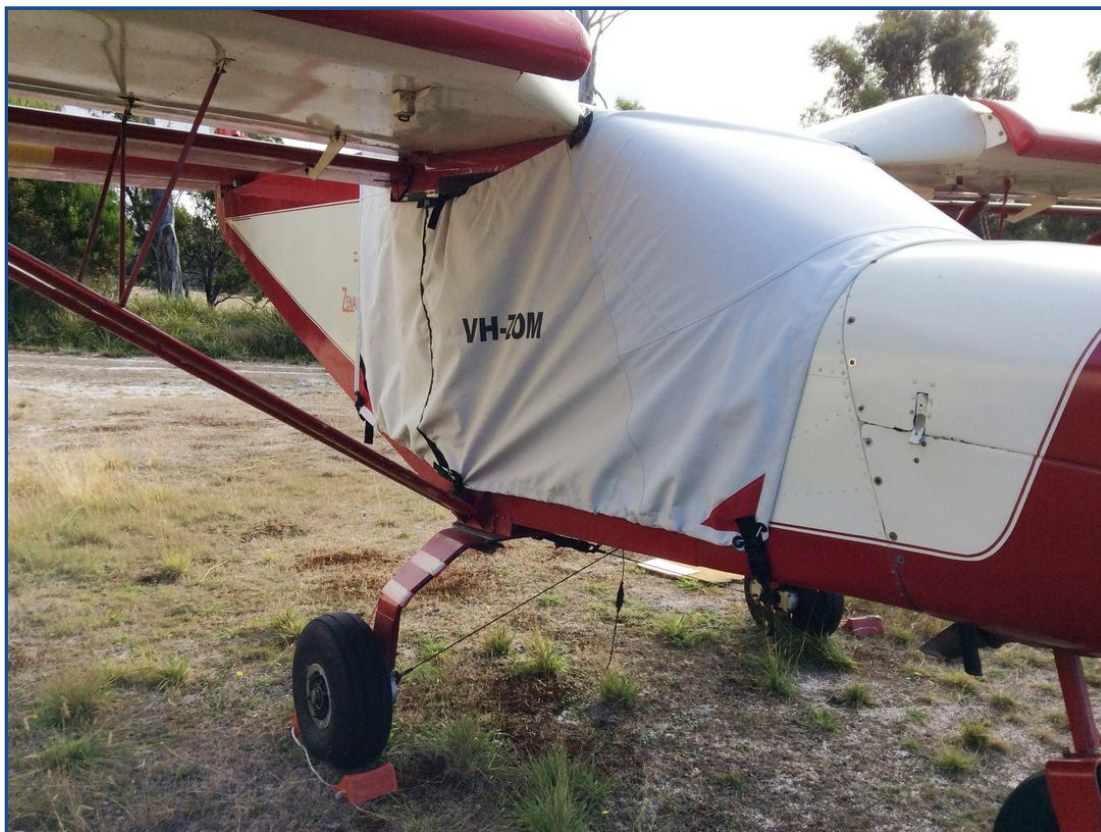
Zenith Z801 Canopy Cover