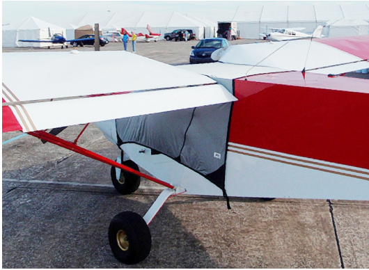
Zenith 701 Spandex FlyAway Travel Canopy Cover

This cover type is made from Silver Acrylic Sunbrella canvas and is 100% lined with a soft and smooth microfiber. Bruce's Custom Covers developed this material combination especially for aircraft protection. The outer material is medium weight and treated for water resistance, UV resistance and anti-static buildup. The inner lining is a very soft and smooth microfiber to prevent scratching. The material is very reflective, and tests show that the cabin interior temperature can be reduced to near-ambient temperature on the hottest of days. It is water, ice and snow repellent, yet breathable to allow moisture to escape from between the cover and the aircraft surface.