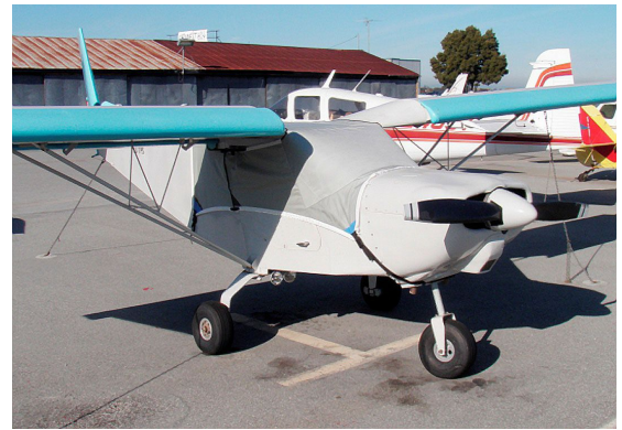
Zenith 801 Standard Canopy Cover