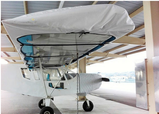
Zenith 801 Wing & Insulated Engine Covers