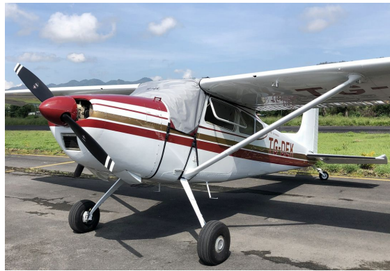
Cessna 180 Windshield Cover