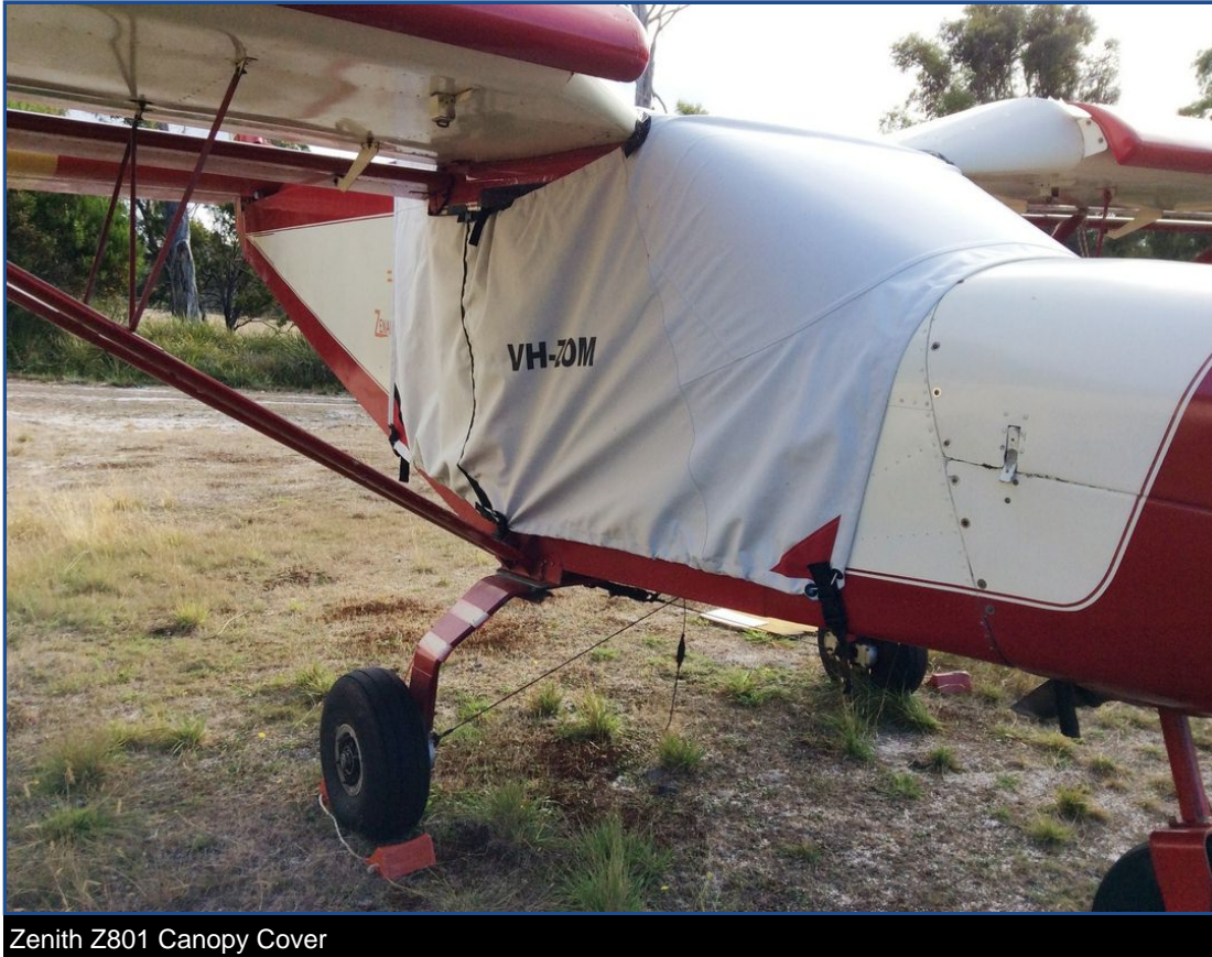
Zenith Z801 Canopy Cover