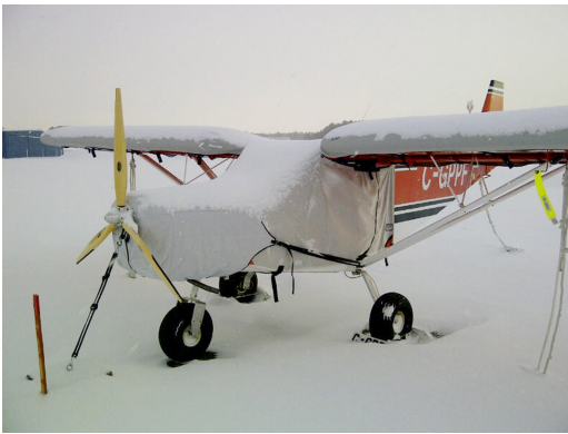
Zenith 701 Canopy, Wing, Tail & Insulated Engine Covers

This cover type is made from Silver Acrylic Sunbrella canvas and is 100% lined with a soft and smooth microfiber. Bruce's Custom Covers developed this material combination especially for aircraft protection. The outer material is medium weight and treated for water resistance, UV resistance and anti-static buildup. The inner lining is a very soft and smooth microfiber to prevent scratching. The material is very reflective, and tests show that the cabin interior temperature can be reduced to near-ambient temperature on the hottest of days. It is water, ice and snow repellent, yet breathable to allow moisture to escape from between the cover and the aircraft surface.