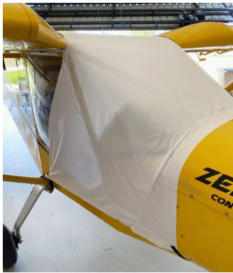
Zenith 750 Windshield Cover

This cover type is made from Silver Acrylic Sunbrella canvas and is 100% lined with a soft and smooth microfiber. Bruce's Custom Covers developed this material combination especially for aircraft protection. The outer material is medium weight and treated for water resistance, UV resistance and anti-static buildup. The inner lining is a very soft and smooth microfiber to prevent scratching. The material is very reflective, and tests show that the cabin interior temperature can be reduced to near-ambient temperature on the hottest of days. It is water, ice and snow repellent, yet breathable to allow moisture to escape from between the cover and the aircraft surface.