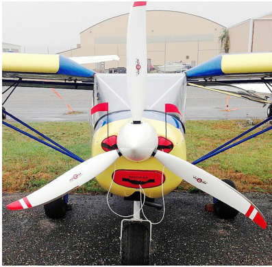
Zenith 701 Engine Inlet Plugs

have warning flags that are visible from the cockpit or 'remove before flight' streamers sewn onto the face of the plugs. Most plugs are imprinted with the aircraft registration number in black for an extra charge. Storage bag NOT included. Engine plugs may be inserted after flight when the engine is still warm. Engine Inlet Plugs are commonly referred to as Cowl Plugs, Intake Plugs, Cowl Blocks, Engine Blocks, and Engine Bungs.