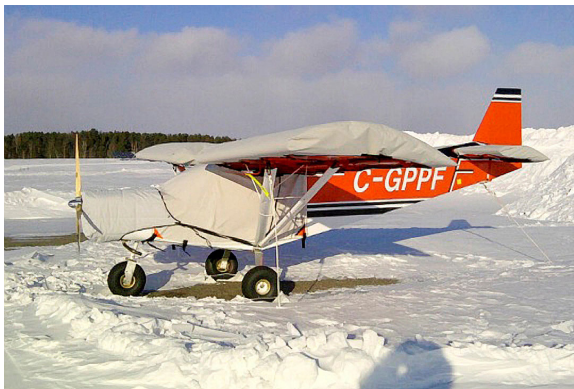
Zenith 701 Canopy, Wing, Tail & Insulated Engine Covers

WINTER USE MATERIAL - Made with Solution-Dyed Polyester fabric, this option is intended for seasonal use to aid in deicing, rain mitigation, or for occasional travel. The material is lighter and more compact, but more susceptible to UV damage and may have a shorter useful life if used continuously outside than the all-year use material.