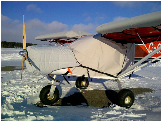
Zenith 701 Canopy, Wing, Tail & Insulated Engine Covers