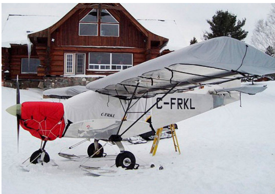
Zenith 801 Insulated Engine, Canopy, Wing & Tail Covers

This cover type is made from Silver Acrylic Sunbrella canvas and is 100% lined with a soft and smooth microfiber. Bruce's Custom Covers developed this material combination especially for aircraft protection. The outer material is medium weight and treated for water resistance, UV resistance and anti-static buildup. The inner lining is a very soft and smooth microfiber to prevent scratching. The material is very reflective, and tests show that the cabin interior temperature can be reduced to near-ambient temperature on the hottest of days. It is water, ice and snow repellent, yet breathable to allow moisture to escape from between the cover and the aircraft surface.