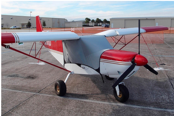
Zenith 701 Spandex FlyAway Travel Canopy Cover

This cover type is made from Silver Acrylic Sunbrella canvas and is 100% lined with a soft and smooth microfiber. Bruce's Custom Covers developed this material combination especially for aircraft protection. The outer material is medium weight and treated for water resistance, UV resistance and anti-static buildup. The inner lining is a very soft and smooth microfiber to prevent scratching. The material is very reflective, and tests show that the cabin interior temperature can be reduced to near-ambient temperature on the hottest of days. It is water, ice and snow repellent, yet breathable to allow moisture to escape from between the cover and the aircraft surface.