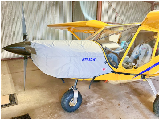
Zenith 750 Cruiser Engine Cover, open on bottom