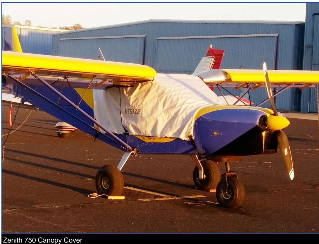
Zenith 750 Canopy Cover