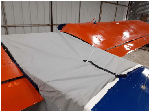
ZENITH CH 750 Travel Weight Extended Canopy Cover