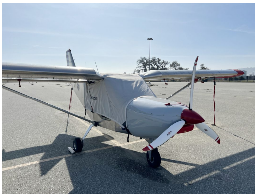
Zenair 750 & Cruzeiro Extended Canopy Cover