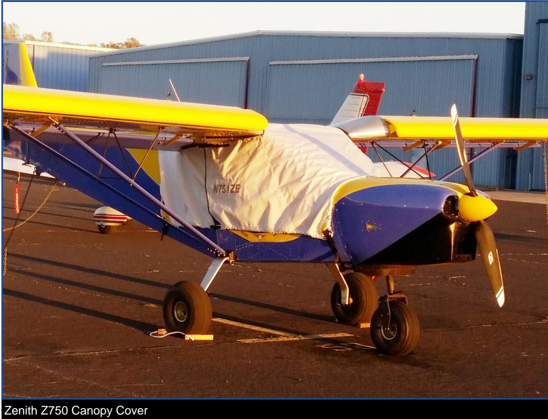
Zenith Z750 Canopy Cover