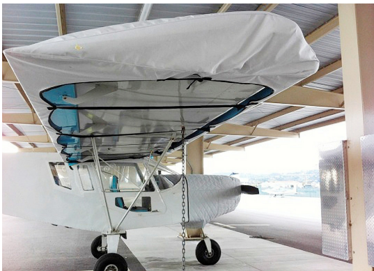
Zenith 801 Wing & Insulated Engine Covers

WINTER USE MATERIAL - Made with Solution-Dyed Polyester fabric, this option is intended for seasonal use to aid in deicing, rain mitigation, or for occasional travel. The material is lighter and more compact, but more susceptible to UV damage and may have a shorter useful life if used continuously outside than the all-year use material.