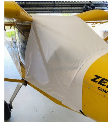
Zenith 750 Windshield Cover