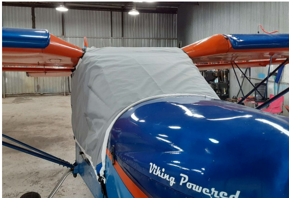
ZENITH CH 750 Travel Weight Extended Canopy Cover

This cover type is made from Silver Acrylic Sunbrella canvas and is 100% lined with a soft and smooth microfiber. Bruce's Custom Covers developed this material combination especially for aircraft protection. The outer material is medium weight and treated for water resistance, UV resistance and anti-static buildup. The inner lining is a very soft and smooth microfiber to prevent scratching. The material is very reflective, and tests show that the cabin interior temperature can be reduced to near-ambient temperature on the hottest of days. It is water, ice and snow repellent, yet breathable to allow moisture to escape from between the cover and the aircraft surface.