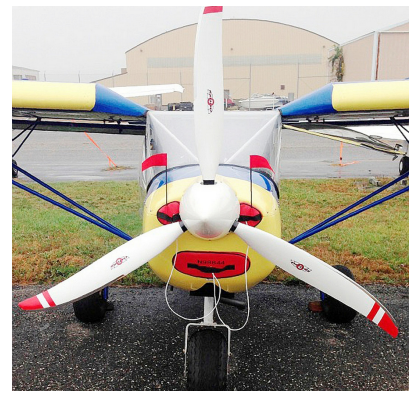
Zenith 701 Engine Inlet Plugs