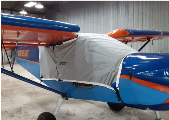
ZENITH CH 750 Travel Weight Extended Canopy Cover

This cover type is made from Silver Acrylic Sunbrella canvas and is 100% lined with a soft and smooth microfiber. Bruce's Custom Covers developed this material combination especially for aircraft protection. The outer material is medium weight and treated for water resistance, UV resistance and anti-static buildup. The inner lining is a very soft and smooth microfiber to prevent scratching. The material is very reflective, and tests show that the cabin interior temperature can be reduced to near-ambient temperature on the hottest of days. It is water, ice and snow repellent, yet breathable to allow moisture to escape from between the cover and the aircraft surface.