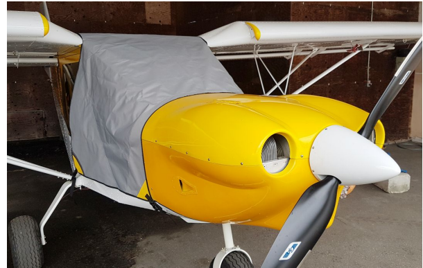
Zenair 750 Lightweight Windshield/Skylight Travel Covers