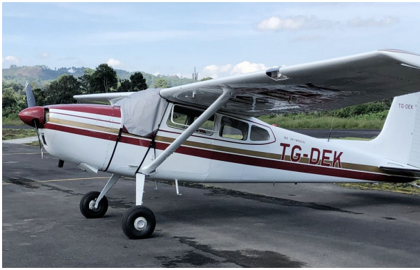
Cessna 180 Windshield Cover