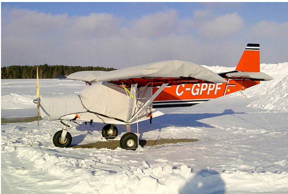
Zenith 701 Canopy, Wing, Tail & Insulated Engine Covers