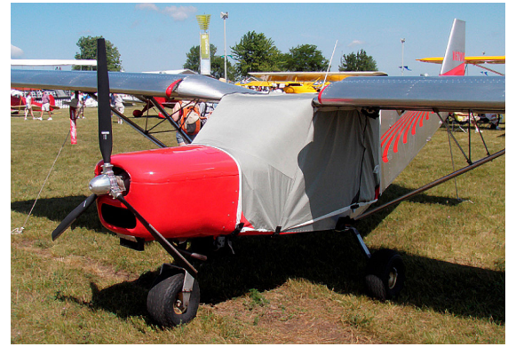
Zenith CH701 Standard Canopy Cover