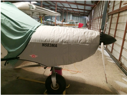
Zenith CH 750 Insulated Engine Cover

The material is very reflective, and tests show that the cabin interior temperature can be reduced to near-ambient temperature on the hottest of days. It is water, ice and snow repellent, yet breathable to allow moisture to escape from between the cover and the aircraft surface.