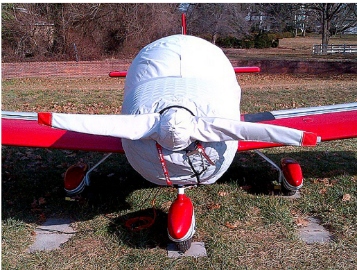
Zenith 601XL Canopy, Prop/Spinner and Insulated Engine Cover Zenith 601XL Canopy, Prop/Spinner and Insulated Engine Cover