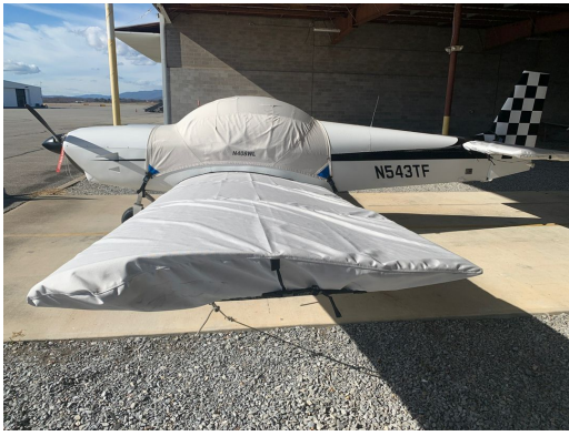
Zenith 601XL Canopy & Wing Covers