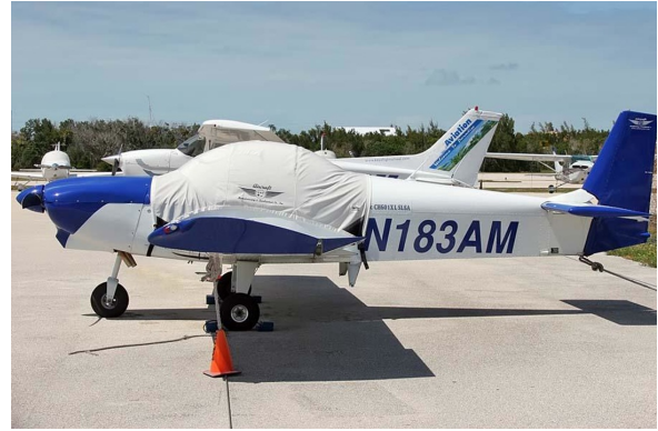
Zenith CH601 Canopy Cover