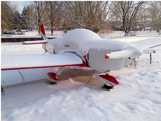
Zenith 601XL Canopy, Prop/Spinner and Insulated Engine Cover

This cover type is made from Silver Acrylic Sunbrella canvas and is 100% lined with a soft and smooth microfiber. Bruce's Custom Covers developed this material combination especially for aircraft protection. The outer material is medium weight and treated for water resistance, UV resistance and anti-static buildup. The inner lining is a very soft and smooth microfiber to prevent scratching. The material is very reflective, and tests show that the cabin interior temperature can be reduced to near-ambient temperature on the hottest of days. It is water, ice and snow repellent, yet breathable to allow moisture to escape from between the cover and the aircraft surface.