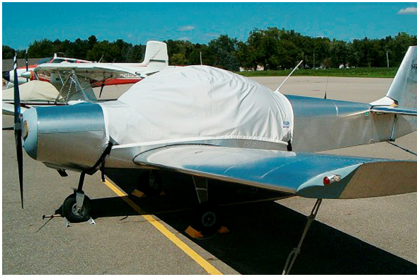
Zenith 650 Canopy Cover