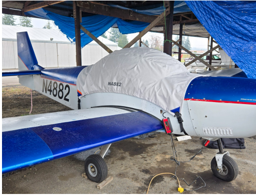
Zenith Zodiac 601XL-B Canopy Cover, 601 model

This cover type is made from Silver Acrylic Sunbrella canvas and is 100% lined with a soft and smooth microfiber. Bruce's Custom Covers developed this material combination especially for aircraft protection. The outer material is medium weight and treated for water resistance, UV resistance and anti-static buildup. The inner lining is a very soft and smooth microfiber to prevent scratching. The material is very reflective, and tests show that the cabin interior temperature can be reduced to near-ambient temperature on the hottest of days. It is water, ice and snow repellent, yet breathable to allow moisture to escape from between the cover and the aircraft surface.