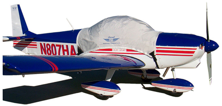
Alarus Canopy Cover