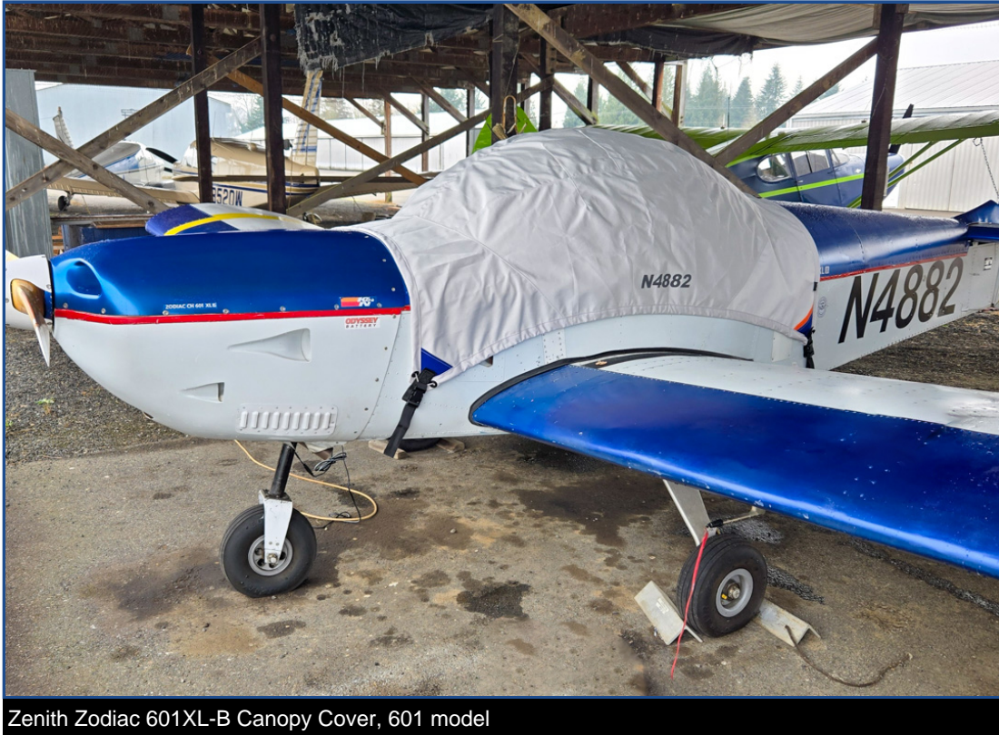
Zenith Zodiac 601XL-B Canopy Cover, 601 model