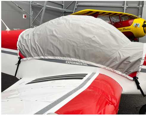
Zenair 601HD Travel Cover, Light Weight Canopy Cover, 601 Model