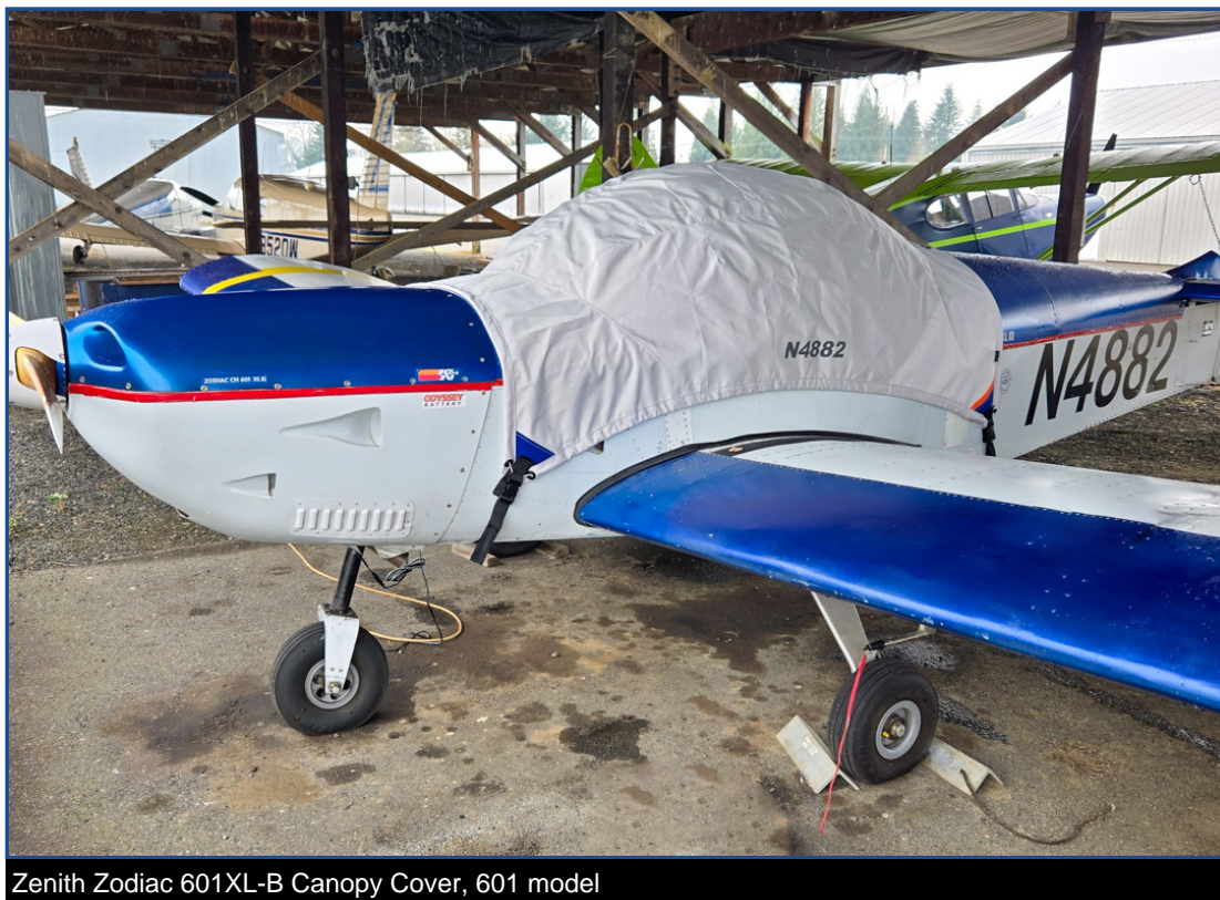
Zenith Zodiac 601XL-B Canopy Cover, 601 model