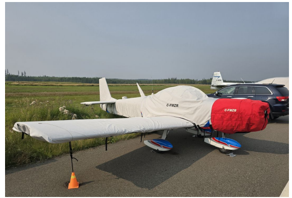
Zenith Zodiac 601XL Cover Set