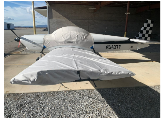
Zenith 601XL Canopy & Wing Covers