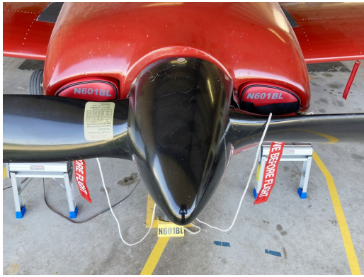
Zenith CH 601 XLB Engine Inlet Plugs