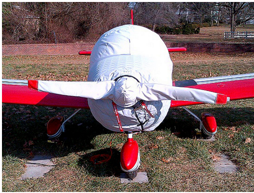
Zenith 601XL Canopy, Prop/Spinner and Insulated Engine Cover

This cover type is made from Silver Acrylic Sunbrella canvas and is 100% lined with a soft and smooth microfiber. Bruce's Custom Covers developed this material combination especially for aircraft protection. The outer material is medium weight and treated for water resistance, UV resistance and anti-static buildup. The inner lining is a very soft and smooth microfiber to prevent scratching. The material is very reflective, and tests show that the cabin interior temperature can be reduced to near-ambient temperature on the hottest of days. It is water, ice and snow repellent, yet breathable to allow moisture to escape from between the cover and the aircraft surface.