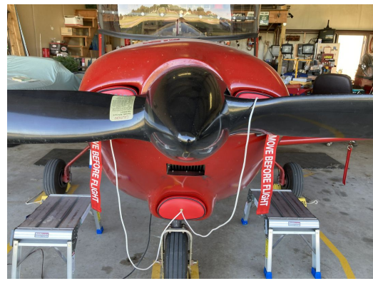
Zenith CH 601 XLB Engine Inlet Plugs