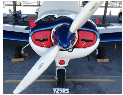
Zenith 601XL Engine Plugs, set of 3