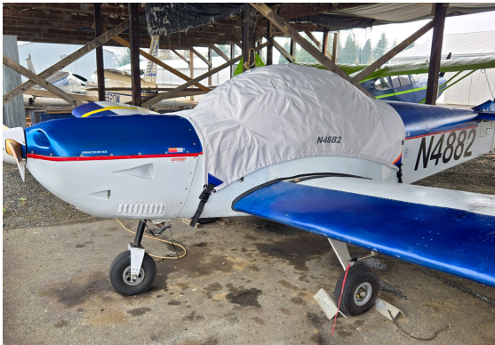
Zenith Zodiac 601XL-B Canopy Cover, 601 model