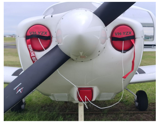
Zenith CH-2000, CH-640 Engine Inlet Plugs