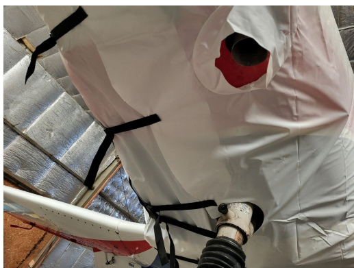
Zlin 142C Engine Cover, test fit cover

This cover type is made from Silver Acrylic Sunbrella canvas and is 100% lined with a soft and smooth microfiber. Bruce's Custom Covers developed this material combination especially for aircraft protection. The outer material is medium weight and treated for water resistance, UV resistance and anti-static buildup. The inner lining is a very soft and smooth microfiber to prevent scratching. The material is very reflective, and tests show that the cabin interior temperature can be reduced to near-ambient temperature on the hottest of days. It is water, ice and snow repellent, yet breathable to allow moisture to escape from between the cover and the aircraft surface.