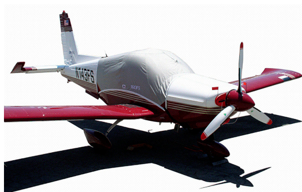
Zlin 143 Canopy Cover and Engine Plugs