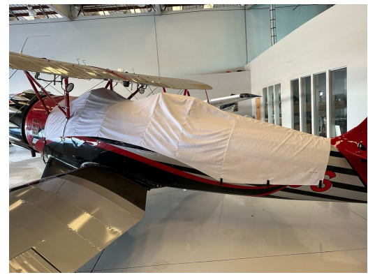
Travel Air 4000 Canopy and Engine Covers, light weight travel type Waco YMF-5 Canopy with Turtledeck Extension, test fit cover