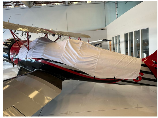
Waco YMF-5 Canopy with Turtledeck Extension, test fit cover