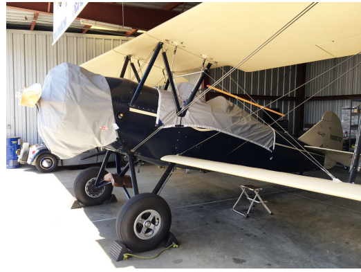
SKYBOLT, Insulated Hangar Blanket, Custom Fit Interior Use) Travel Air 4000 Canopy and Engine Covers, light weight travel type