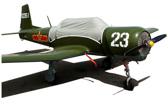
CJ-6 Nanchang Canopy Cover

This cover type is made from Silver Acrylic Sunbrella canvas and is 100% lined with a soft and smooth microfiber. Bruce's Custom Covers developed this material combination especially for aircraft protection. The outer material is medium weight and treated for water resistance, UV resistance and anti-static buildup. The inner lining is a very soft and smooth microfiber to prevent scratching. The material is very reflective, and tests show that the cabin interior temperature can be reduced to near-ambient temperature on the hottest of days. It is water, ice and snow repellent, yet breathable to allow moisture to escape from between the cover and the aircraft surface.