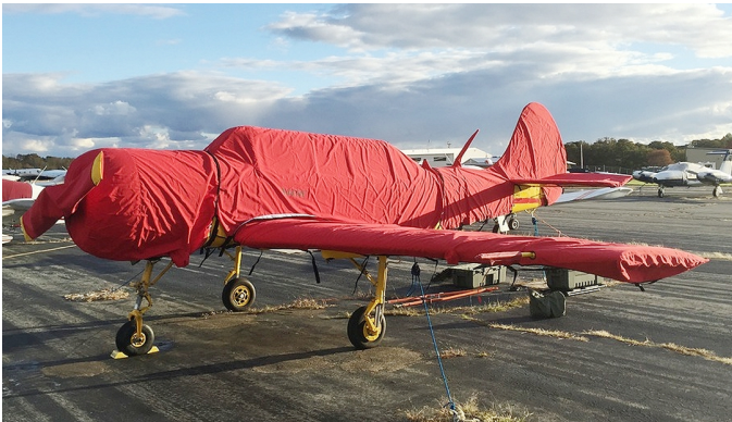
Yak 52 Full Cover Set