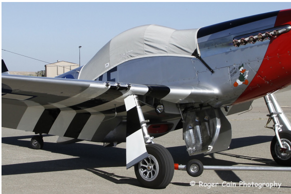
North American P-51 Canopy Cover