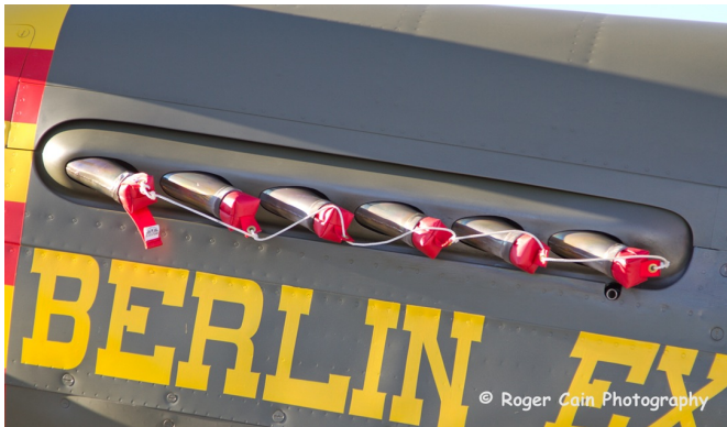
North American P-51 Exhaust Plugs

Engine Inlet Plugs are custom fit for your Yakovlev Yak 3 intakes, made with heavy-duty vinyl material, and stuffed with a single block of sculpted urethane foam. Each plug has a zipper that allows the foam to be removed and dried if necessary. Engine plugs have warning flags that are visible from the cockpit or 'remove before flight' streamers sewn onto the face of the plugs. Most plugs are imprinted with the aircraft registration number in black for an extra charge. Storage bag NOT included. Engine plugs may be inserted after flight when the engine is still warm. Engine Inlet Plugs are commonly referred to as Cowl Plugs, Intake Plugs, Cowl Blocks, Engine Blocks, and Engine Bungs.