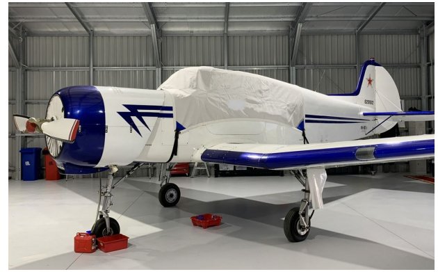
Yak 18T Canopy Cover