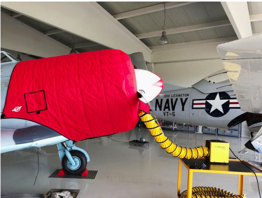
Yak 11 Insulated Engine Cover