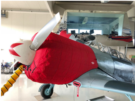
Yak 11 Insulated Engine Cover & Oil Cooler Inlet Plug