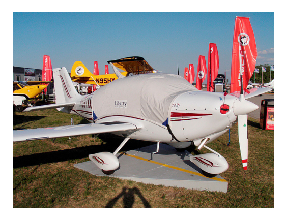
XL-2 Canopy Cover & Engine Plugs