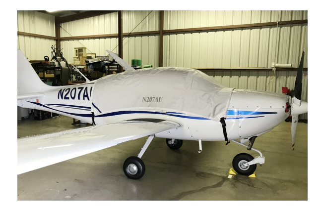
Liberty Aerospace Liberty XL-2 Canopy Cover

This cover type is made from Silver Acrylic Sunbrella canvas and is 100% lined with a soft and smooth microfiber. Bruce's Custom Covers developed this material combination especially for aircraft protection. The outer material is medium weight and treated for water resistance, UV resistance and anti-static buildup. The inner lining is a very soft and smooth microfiber to prevent scratching. The material is very reflective, and tests show that the cabin interior temperature can be reduced to near-ambient temperature on the hottest of days. It is water, ice and snow repellent, yet breathable to allow moisture to escape from between the cover and the aircraft surface.