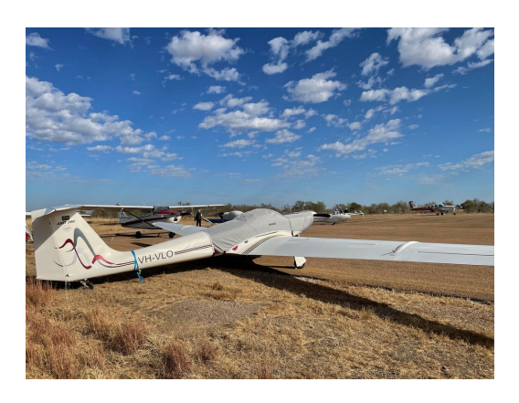
Ximango AMT Light Weight Travel Canopy/Engine Cover