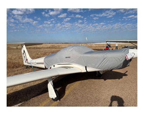
Ximango AMT Light Weight Travel Canopy/Engine Cover