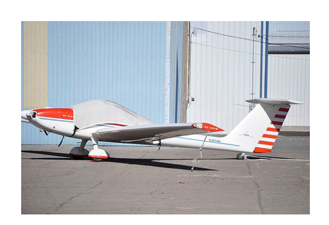
Grob 109 Canopy Cover