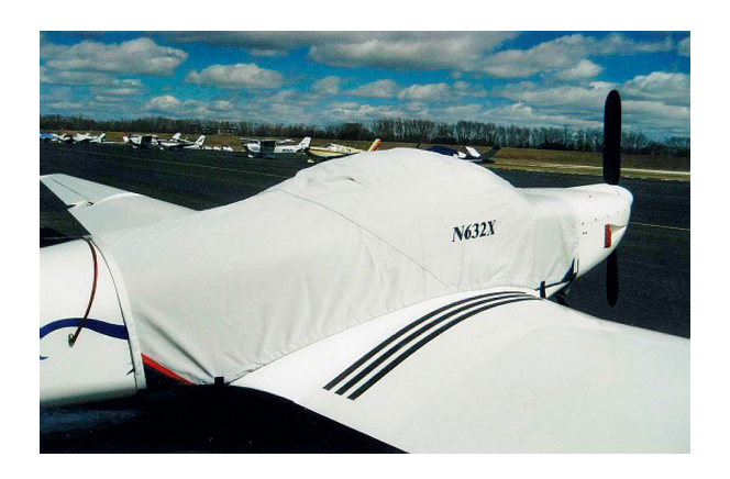
Ximango Extended Canopy Cover