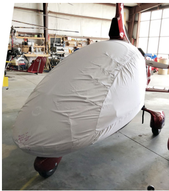
Cavalon Gyrocopter Bubble Cover, test fit cover