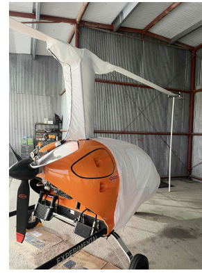
Celier Argon 915 Canopy/Nose Cover, Rotor Mast Cover, test fit covers Celier Argon 915 Canopy/Nose Cover, Rotor Mast Cover, test fit covers