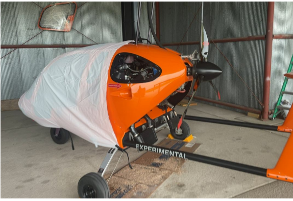
Celier Argon 915 Canopy/Nose Cover, test fit cover