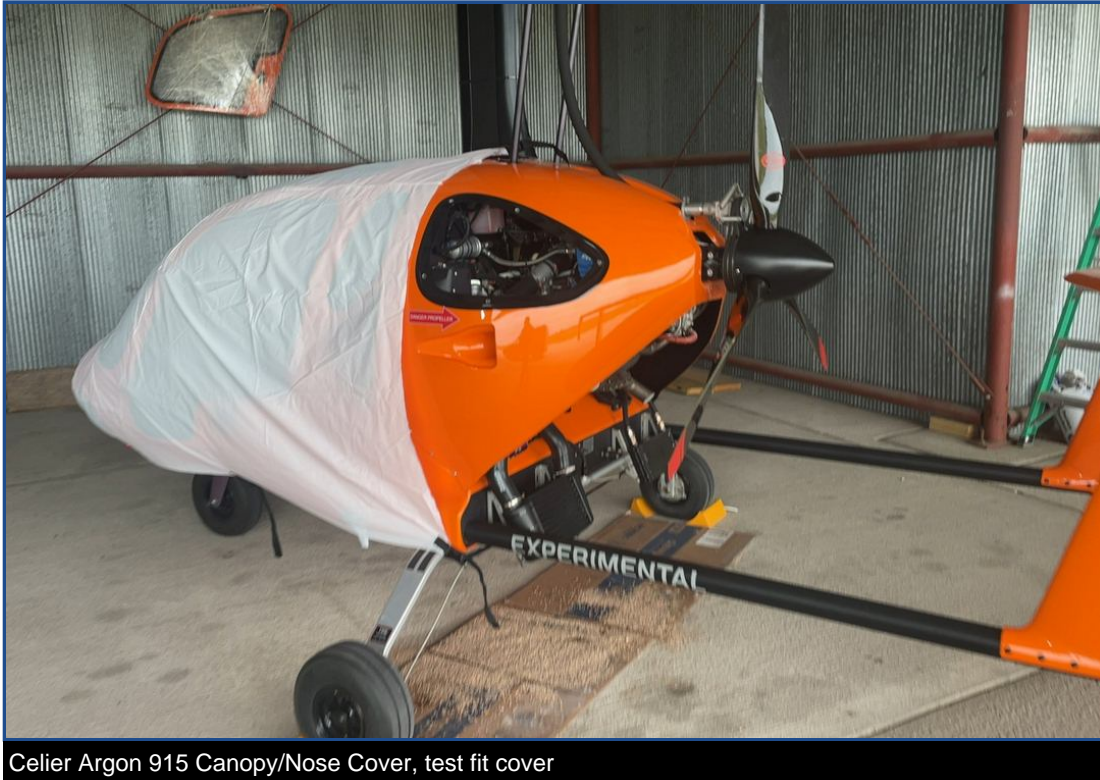
Celier Argon 915 Canopy/Nose Cover, test fit cover