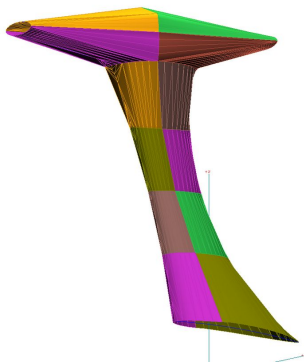
Autogyro Calidus Rotor Mast Cover, 3D model

Bruce's Celier Xenon, Argon Gyrocopter Blade Covers are made of medium-weight Solution-Dyed Polyester and designed to avoid trim tabs or wicks. You can install Blade Covers from the ground with the aid of a lightweight rope attached to the open end. Covers are cinched tight at the blade root with straps and quick-release plastic buckles. The Cold Weather Blade Covers are fitted with full-length zippers and optional deice "boots" designed to accept a preheater hose; a small opening at the tip of the cover allows for some air circulation and drainage in freezing weather. Some part numbers have features for an extra charge.