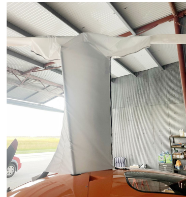
Celier Argon 915 Rotor Mast Cover, test fit cover