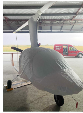
Celier Argon 915 Canopy/Nose Cover, Rotor Mast Cover, test fit covers