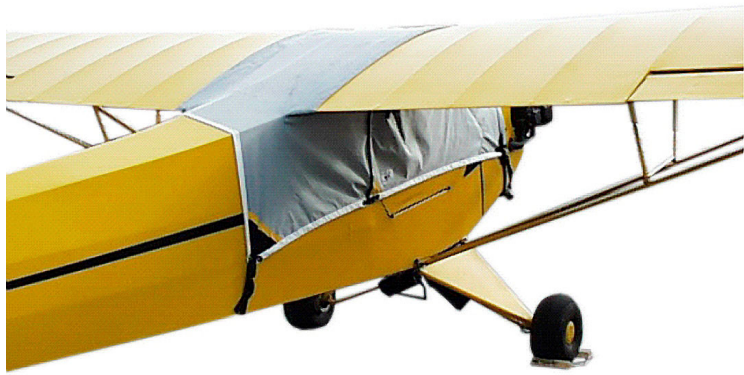
Piper J3 Over-Top Canopy Cover