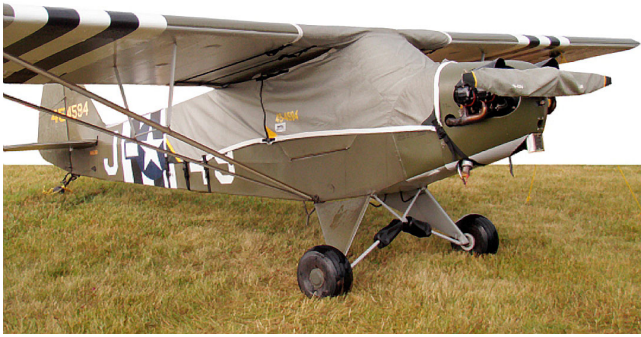
Piper J3 Extended Canopy Cover & Propellor Cover