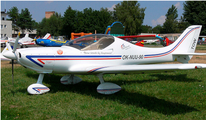
Covers, Plugs & HeatShields for Dynamic WT9

This cover type is made from Silver Acrylic Sunbrella canvas and is 100% lined with a soft and smooth microfiber. Bruce's Custom Covers developed this material combination especially for aircraft protection. The outer material is medium weight and treated for water resistance, UV resistance and anti-static buildup. The inner lining is a very soft and smooth microfiber to prevent scratching. The material is very reflective, and tests show that the cabin interior temperature can be reduced to near-ambient temperature on the hottest of days. It is water, ice and snow repellent, yet breathable to allow moisture to escape from between the cover and the aircraft surface.