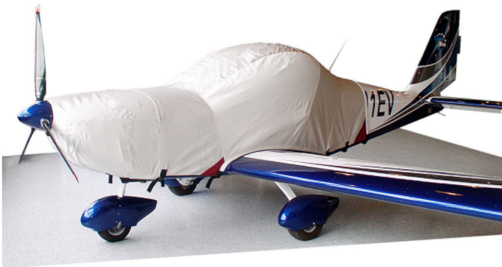
Evektor Sportstar Extended Canopy/Engine Cover

This cover type is made from Silver Acrylic Sunbrella canvas and is 100% lined with a soft and smooth microfiber. Bruce's Custom Covers developed this material combination especially for aircraft protection. The outer material is medium weight and treated for water resistance, UV resistance and anti-static buildup. The inner lining is a very soft and smooth microfiber to prevent scratching. The material is very reflective, and tests show that the cabin interior temperature can be reduced to near-ambient temperature on the hottest of days. It is water, ice and snow repellent, yet breathable to allow moisture to escape from between the cover and the aircraft surface.