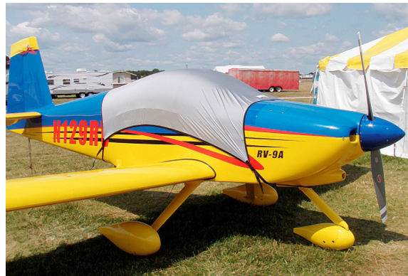
Van's RV-9A Light Weight Travel-Cover

Travel Covers are made with Silver Solution-Dyed Polyester fabric and only lined over the windshield to save weight. The material is lightweight and more compact for easy stowage in the aircraft. The polyester material is water resistant, but only intended for occasional use outside. We also have an ultra lightweight material available for fitted hangar dust covers. For daily outdoor use, the non-travel Sunbrella Cover is the best choice.