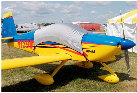
Van's RV-9A Light Weight Travel-Cover