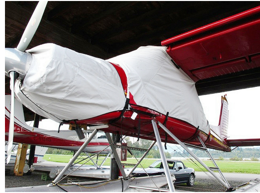
Wilga 2000 Canopy and Engine Covers