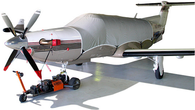
PC-12 Canopy Cover, Engine Plugs, Prop Tie/Exhaust Covers