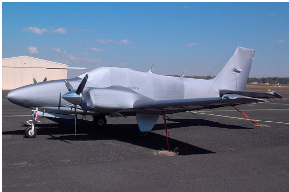
Baron FULL COVER SET, Light Weight Travel &/or Fitted Dust Cover Set