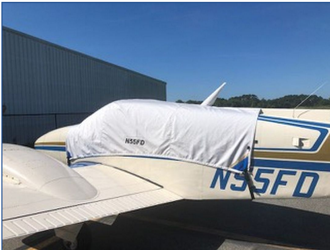
Beech Baron 95-B55 Canopy cover