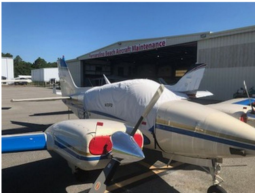
Beech Baron 95-B55 Canopy cover

the hottest of days. It is water, ice and snow repellent, yet breathable to allow moisture to escape from between the cover and the aircraft surface.