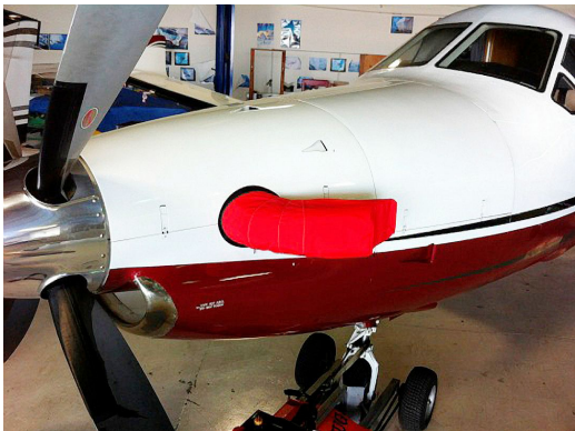
Pilatus PC-12 Exhaust Cover, Fully Enclosed, for protection against corrosion.

Prop Tie-Down/Exhaust Covers are made of heavy duty red vinyl material. Thick nylon webbing runs from the exhaust covers to the prop boot. This webbing is adjustable with plastic buckles, and is held tight with a steel spring where it attaches to the prop boot.