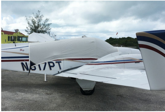
Beech Baron 58 Canopy Cover

the hottest of days. It is water, ice and snow repellent, yet breathable to allow moisture to escape from between the cover and the aircraft surface.