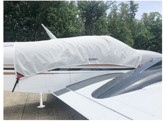
Baron G58 Travel Cover