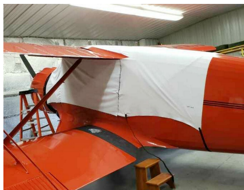
Waco YKC Canopy Cover, test fit cover