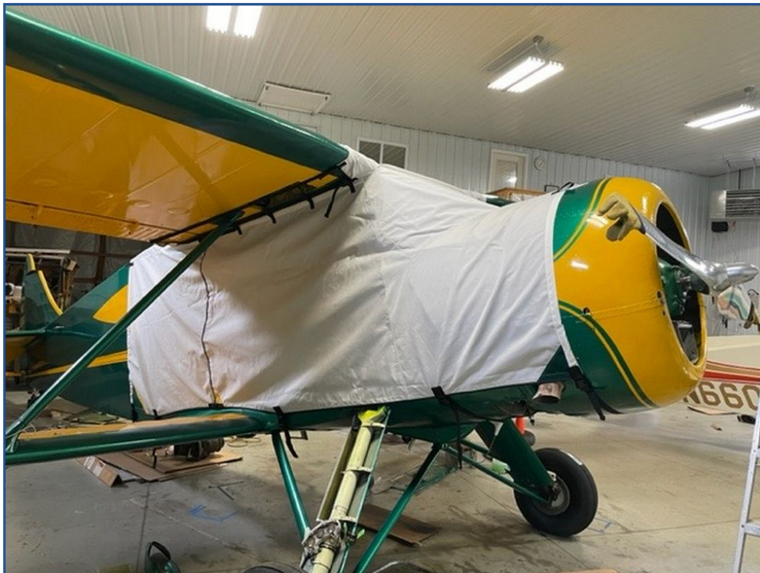
Waco Cabin Biplane Cabin Cover (Over Top Type), Ext. To Cover Baggage Door