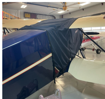
Waco YQC-6 Canopy Cover, over-top type