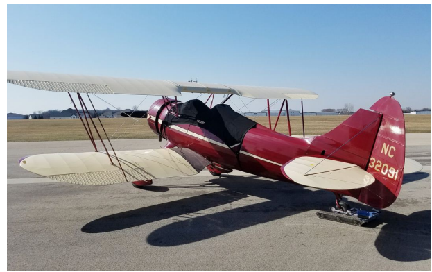
Waco UPF-7 Canopy Cover