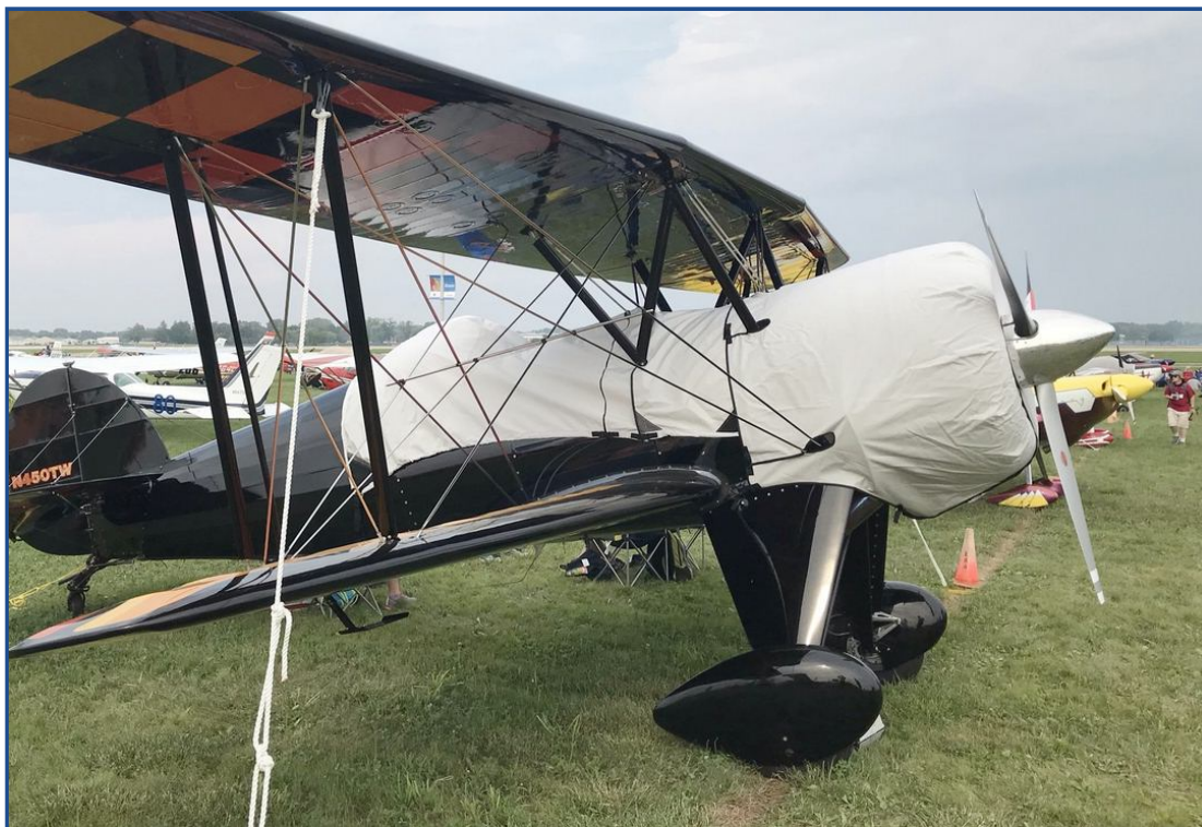
Waco Taperwing Cockpit &amp; Engine Covers