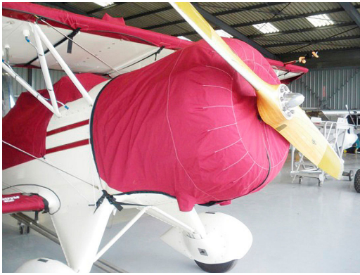
Waco UPF-7 Engine Cover