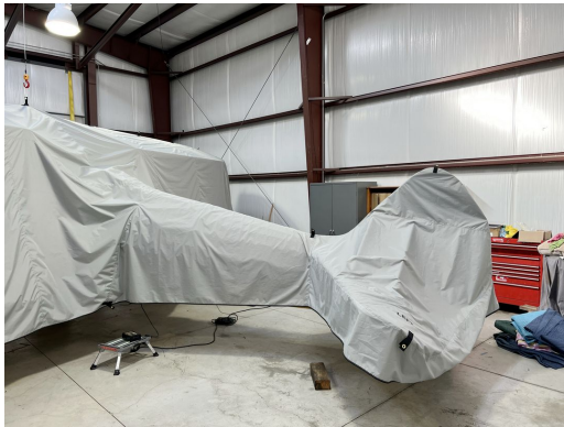
Stearman PT-13 Full Body Dust Cover, Prop Cover Included

Some high value aircraft end up logging lots of hangar time, and become dust magnets in the process. A high quality, well fitting dust cover provides easy assurance that the aircraft's surfaces remain clean and free of grit and grime. Available in a large variety of colors, each dust cover is custom made according to aircraft details and customer preferences. Fire retardant fabrics are also available.