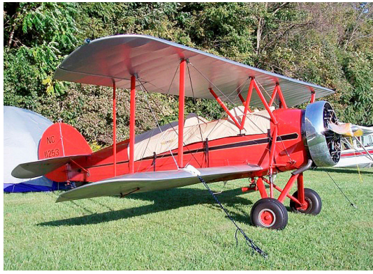
Waco ASO Canopy Cover