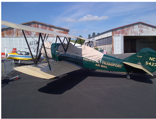
Travelair 4000 Canopy and Engine Cover