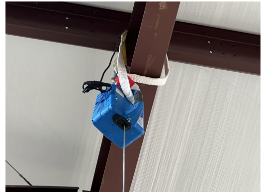
Stearman PT-13 Full Body Dust Cover, Remote Control Winch