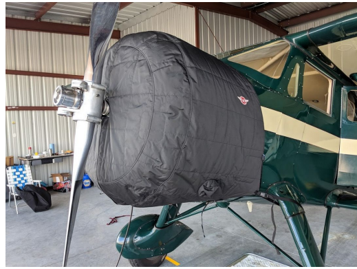
Wacon Cabin Biplane ZQC-6 Insulated Engine Cover