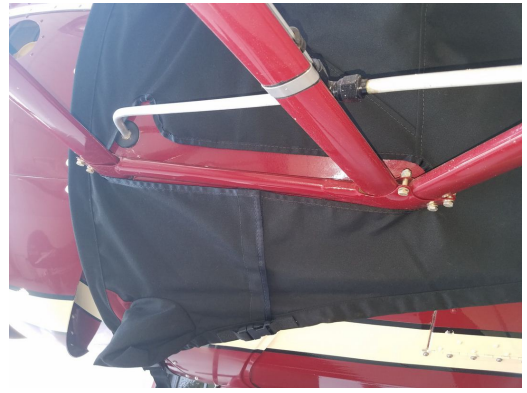
Waco UPF-7 Canopy Cover