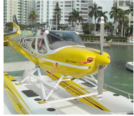
Glastar Engine Plugs