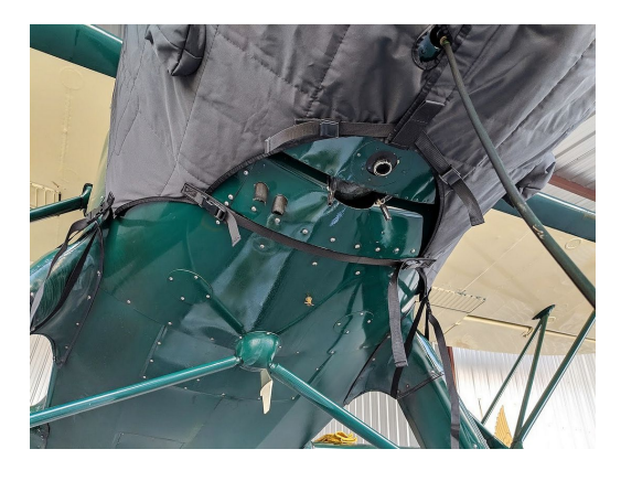
Wacon Cabin Biplane ZQC-6 Insulated Engine Cover