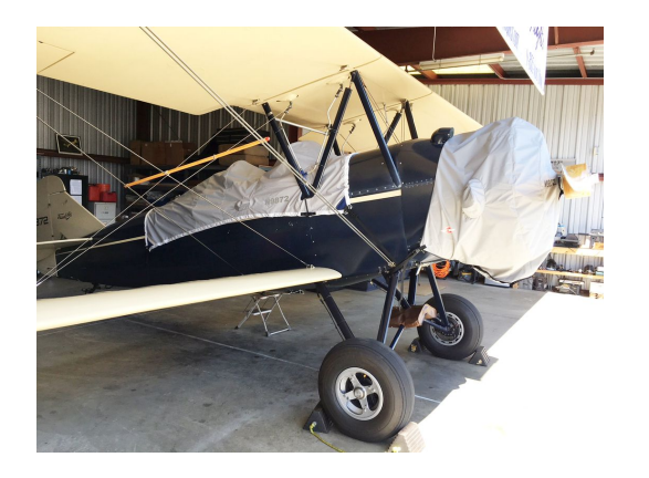
Travel Air 4000 Canopy and Engine Covers, light weight travel Travel Air 4000 Canopy and Engine Covers, light weight travel type