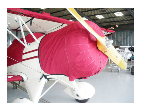
Waco UPF-7 Engine Cover