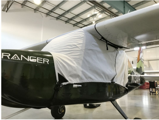
Vashon Ranger R7 Canopy Cover