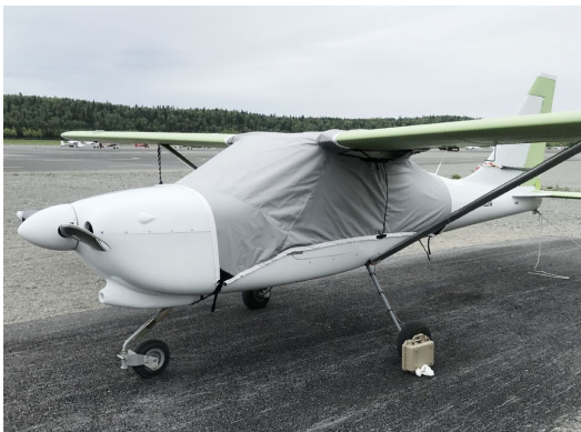
Glasair Aviation Glastar, Sportsman 2+2 Travel Cover, Light Weight Travel Canopy Cover