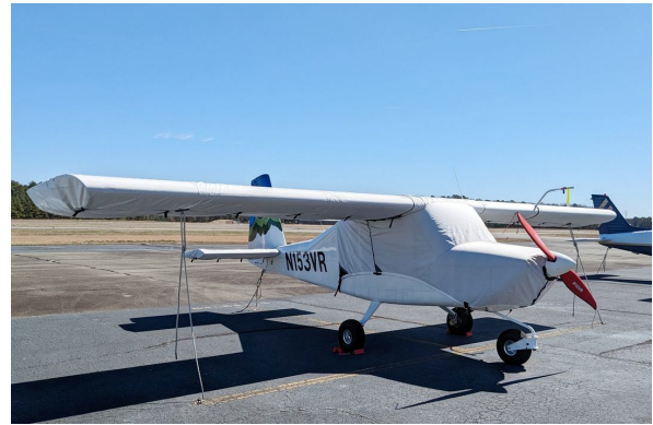
Vashon R7 Ranger Canopy/Engine, Wing & Horiz. Stab. Covers