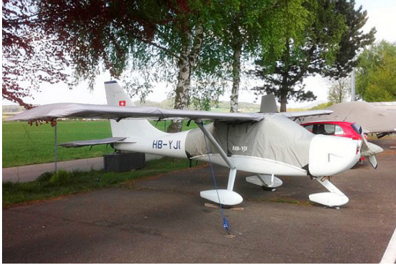
OMF Symphony Canopy, Wings, Horiz. Stab, and Prop Covers

water resistance, UV resistance and anti-static buildup. The inner lining is a very soft and smooth microfiber to prevent scratching. The material is very reflective, and tests show that the cabin interior temperature can be reduced to near-ambient temperature on the hottest of days. It is water, ice and snow repellent, yet breathable to allow moisture to escape from between the cover and the aircraft surface.