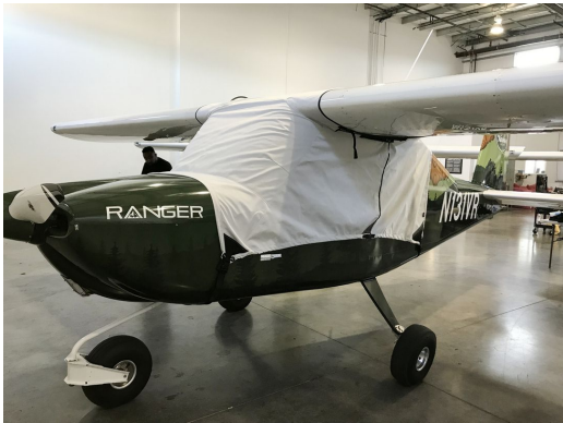
Vashon Ranger R7 Canopy Cover