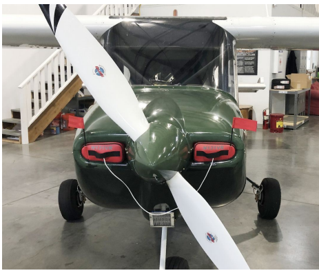
Vashon Ranger R7 Engine Plugs