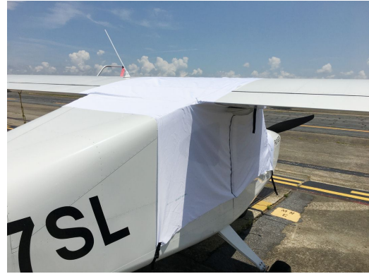
Vashon Ranger VR-7 Canopy Cover, test fit cover