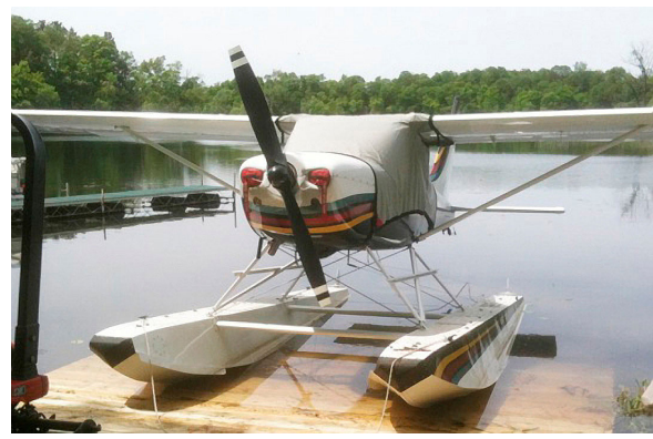
Glastar Sportsman Canopy Cover and Engine Plugs