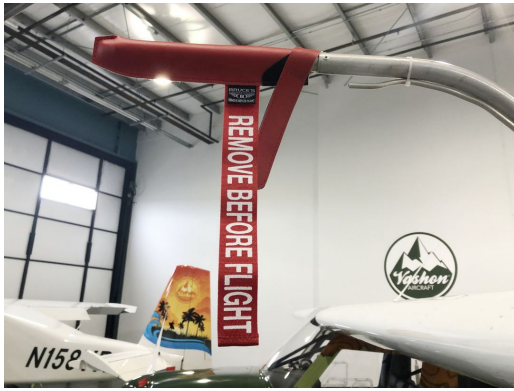
Vashon Ranger R7 Pitot Cover