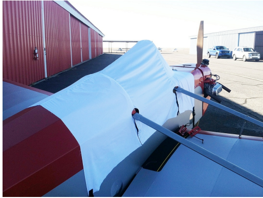
Volksplane Canopy Cover (test fit cover)

Travel Covers are made with Silver Solution-Dyed Polyester fabric and only lined over the windshield to save weight. The material is lightweight and more compact for easy stowage in the aircraft. The polyester material is water resistant, but only intended for occasional use outside. We also have an ultra lightweight material available for fitted hangar dust covers. For daily outdoor use, the non-travel Sunbrella Cover is the best choice.