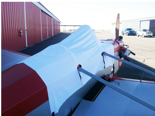
Volksplane Canopy Cover (test fit cover)