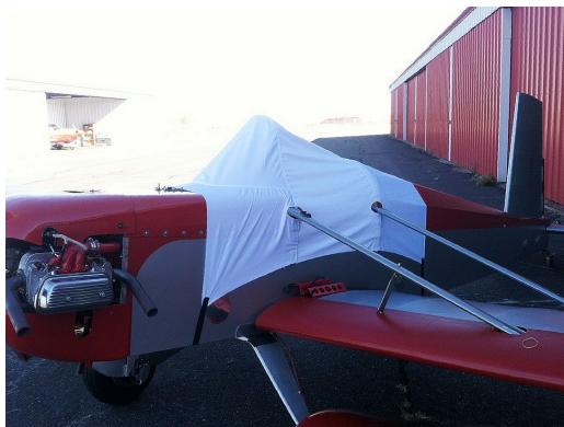
Volksplane Canopy Cover (test fit cover)

the hottest of days. It is water, ice and snow repellent, yet breathable to allow moisture to escape from between the cover and the aircraft surface.