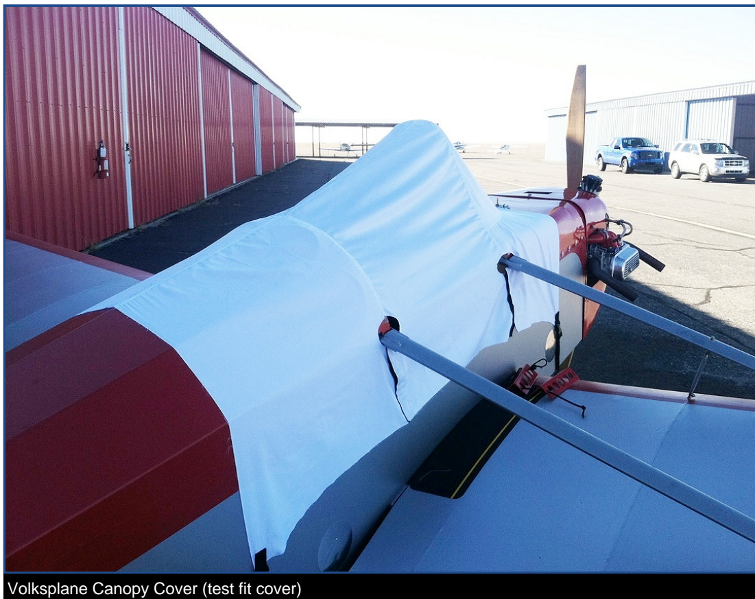
Volksplane Canopy Cover (test fit cover)