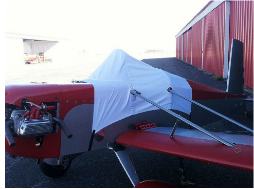
Volksplane Canopy Cover (test fit cover)