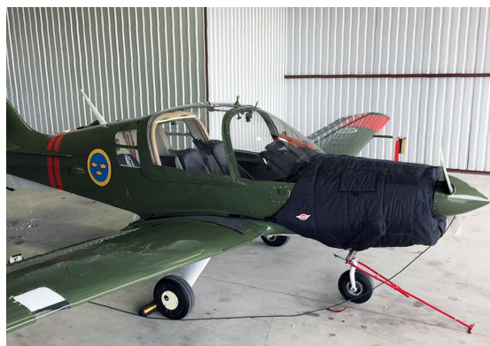
Scottish Aviation Bulldog Insulated Engine Cover