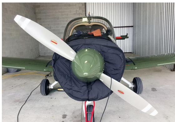
Scottish Aviation Bulldog Insulated Engine Cover

This cover type is made from Silver Acrylic Sunbrella canvas and is 100% lined with a soft and smooth microfiber. Bruce's Custom Covers developed this material combination especially for aircraft protection. The outer material is medium weight and treated for water resistance, UV resistance and anti-static buildup. The inner lining is a very soft and smooth microfiber to prevent scratching. The material is very reflective, and tests show that the cabin interior temperature can be reduced to near-ambient temperature on the hottest of days. It is water, ice and snow repellent, yet breathable to allow moisture to escape from between the cover and the aircraft surface.