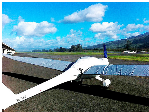
Lambda Canopy/Engine Cover and Wing Covers