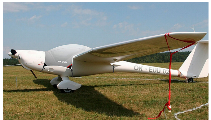
Lambada Canopy Cover (illustration)