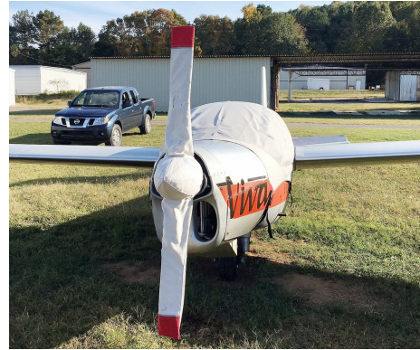
Aerotechnik L-13 Vivat Motorglider Prop/Spinner &amp; Canopy Covers