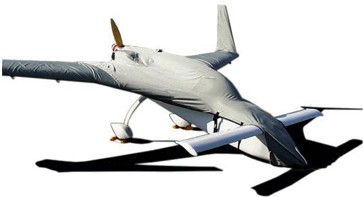
Long-EZ Canopy/Engine and Wing Covers