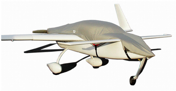
Cozy III Canopy/Nose/Engine Cover