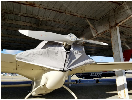
Rutan Vari EZ Travel Cover/Nose/Engine Cover