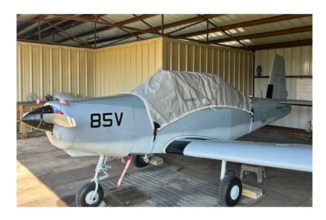
Varga Kachina Travel Cover, Light Weight Canopy Cover