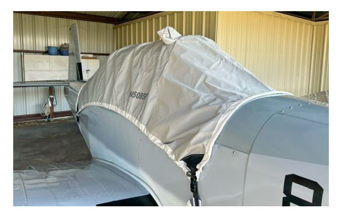
Varga Kachina Travel Cover, Light Weight Canopy Cover