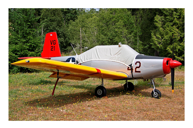
Varga Kachina Canopy Cover

This cover type is made from Silver Acrylic Sunbrella canvas and is 100% lined with a soft and smooth microfiber. Bruce's Custom Covers developed this material combination especially for aircraft protection. The outer material is medium weight and treated for water resistance, UV resistance and anti-static buildup. The inner lining is a very soft and smooth microfiber to prevent scratching. The material is very reflective, and tests show that the cabin interior temperature can be reduced to near-ambient temperature on the hottest of days. It is water, ice and snow repellent, yet breathable to allow moisture to escape from between the cover and the aircraft surface.