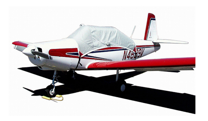
Canopy Cover for the Varga Kachina