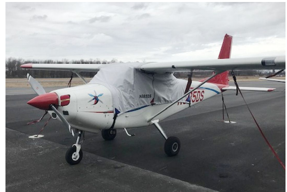
Vulcanair V1.0 canopy cover, Over Top style