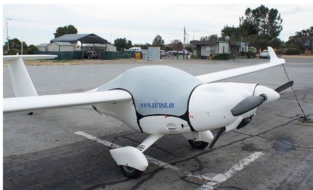
Lambda Travel Canopy Cover