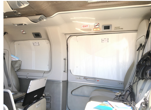
Eurocopter EC-145 Cabin Heatshields