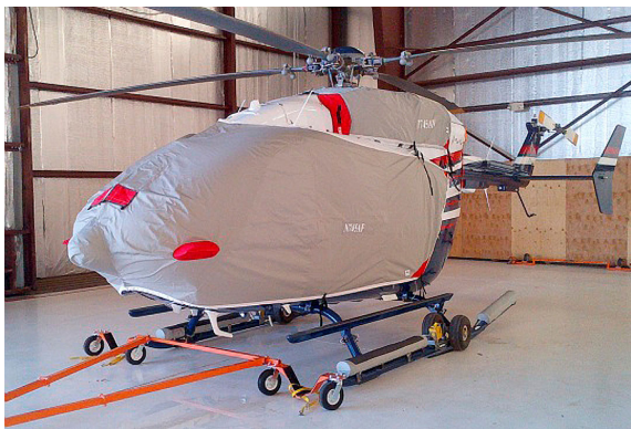
Bubble Cover w/ nose mounted radome & Upper Deck Plugs/Cover