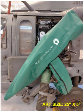
UH60 50 cal. Gun Cover