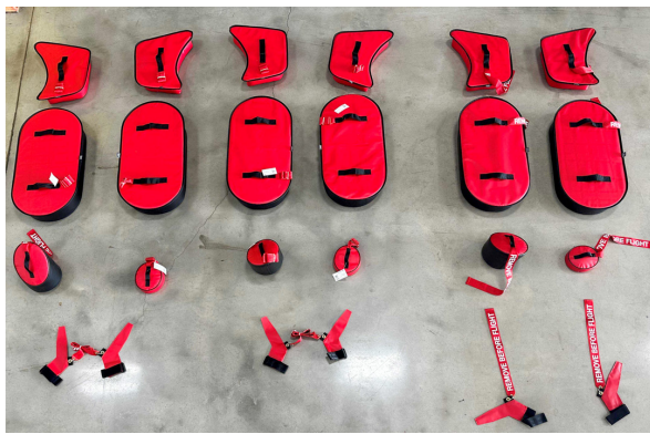
Sikorsky UH-60A Plug Set