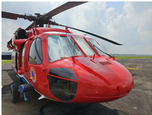
Sikorsky UH-60 Cockpit HeatShields

Cockpit Heatshields are interior sunshades for the aircraft's cockpit. The product is a unique composite of closed-cell foam with a silver mylar finish. The semi-rigid design is stiff enough to stand inside the window framing. Darts and folds are incorporated into the material so that it conforms to the complex shape of the helicopter windows. The set folds up flat and is easily stored in the included storage sleeve. Some designs may require velcro and suction cups. A Heatshield is an excellent short-term remedy for cockpit overheating, but an external fabric cover is more effective for long-term protection.