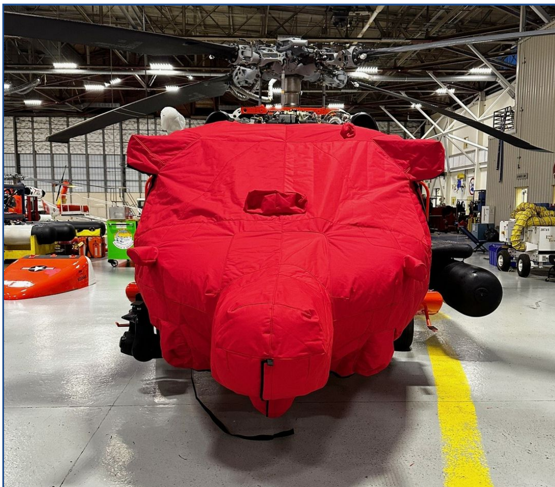
U.S. Coast Guard MH-60 Cockpit/Nose Cover