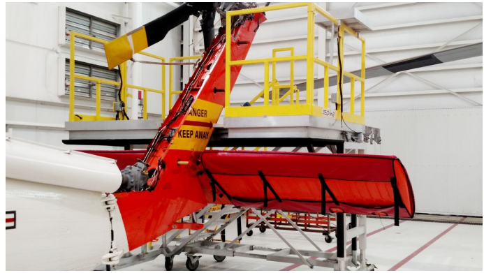
Sikorsky Blackhawk Horizontal Stabilizer Covers, Padded for maintenance protection