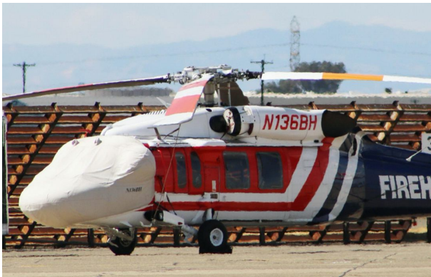
Sikorsky UH-60 Windshield/Nose Cover

This cover type is made from Silver Acrylic Sunbrella canvas and is 100% lined with a soft and smooth microfiber. Bruce's Custom Covers developed this material combination especially for aircraft protection. The outer material is medium weight and treated for water resistance, UV resistance and anti-static buildup. The inner lining is a very soft and smooth microfiber to prevent scratching. The material is very reflective, and tests show that the cabin interior temperature can be reduced to near-ambient temperature on the hottest of days. It is water, ice and snow repellent, yet breathable to allow moisture to escape from between the cover and the aircraft surface.