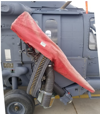
UH60 50 cal. Gun Cover

ALL-YEAR USE MATERIAL - Made with Silver Acrylic Sunbrella canvas, the all-year use material is the best option for sun protection and cover longevity. This heavier more durable material is intended for all weather conditions, such as rain and snow or lots of sun.