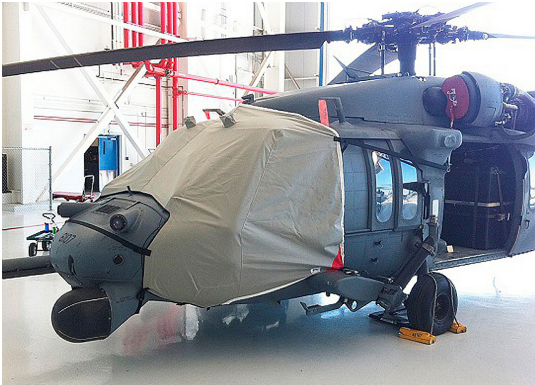
Sikorsky UH-60 Intake/Exhaust Cover Set (IR suppressors)

This cover type is made from Silver Acrylic Sunbrella canvas and is 100% lined with a soft and smooth microfiber. Bruce's Custom Covers developed this material combination especially for aircraft protection. The outer material is medium weight and treated for water resistance, UV resistance and anti-static buildup. The inner lining is a very soft and smooth microfiber to prevent scratching. The material is very reflective, and tests show that the cabin interior temperature can be reduced to near-ambient temperature on the hottest of days. It is water, ice and snow repellent, yet breathable to allow moisture to escape from between the cover and the aircraft surface.