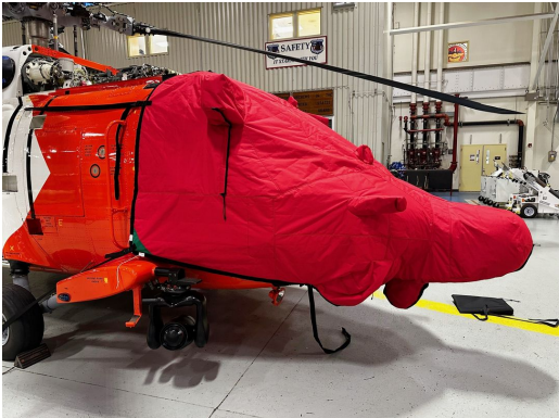
U.S. Coast Guard MH-60 Cockpit/Nose Cover