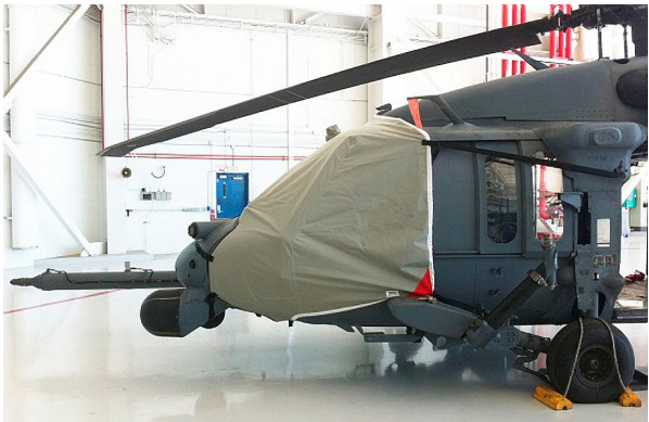
Sikorsky UH-60 Intake/Exhaust Cover Set (IR suppressors)