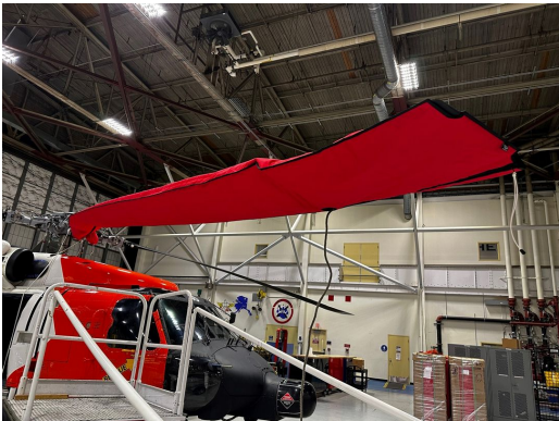
U.S. Coast Guard MH-60 Blade Covers

WINTER USE MATERIAL - Made with Solution-Dyed Polyester fabric, this option is intended for seasonal use to aid in deicing, rain mitigation, or for occasional travel. The material is lighter and more compact, but more susceptible to UV damage and may have a shorter useful life if used continuously outside than the all-year use material.