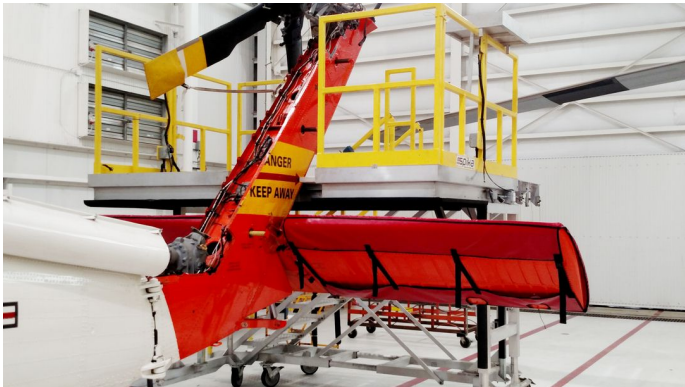
Sikorsky Blackhawk Horizontal Stabilizer Covers, Padded for maintenance protection

Designed to prevent damage to the aircraft extremities in crowded hangars, these products are made of bright red Naugahyde and thickly padded with a sandwich of closed cell foam.