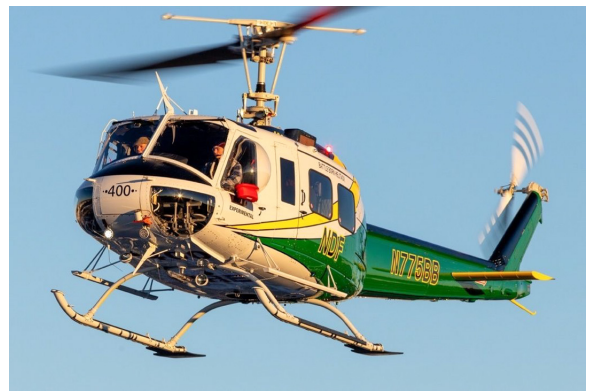
Bell 205 Logger Window Plug