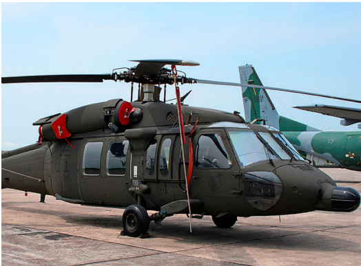
Engine Intake Plugs, Hirs Intake Plug Set, Exhaust Plug Set