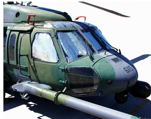
Cockpit HeatShields for UH60